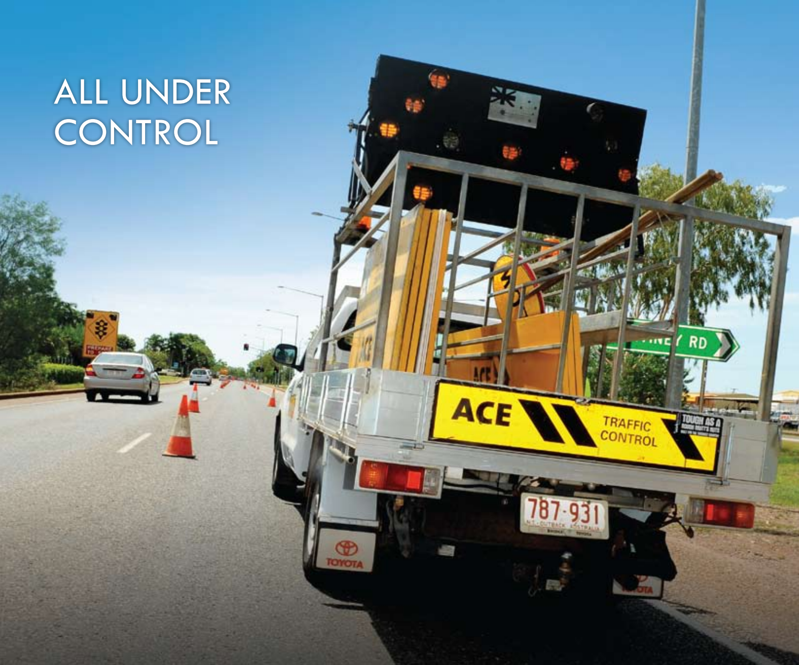
Tiger Brennan Drive Extension, NT

A ce Traffic Control established itself in 2000 as the first traffic control company in the Northern Territory.