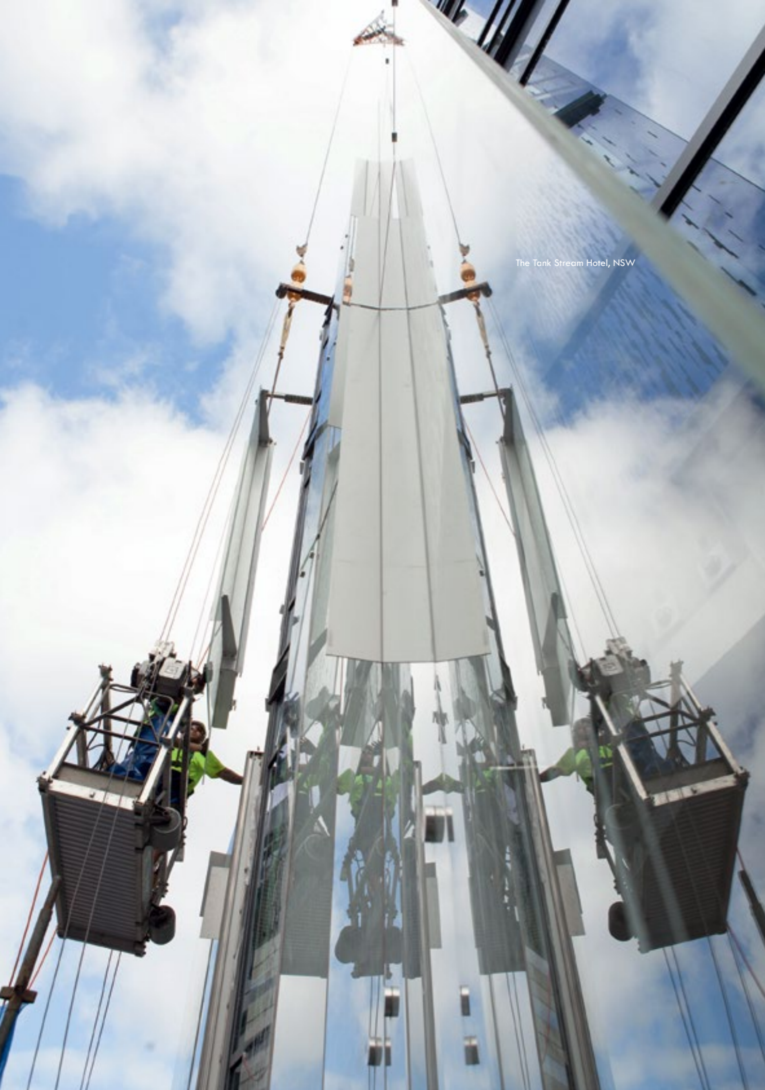
The Tank Stream Hotel, NSW