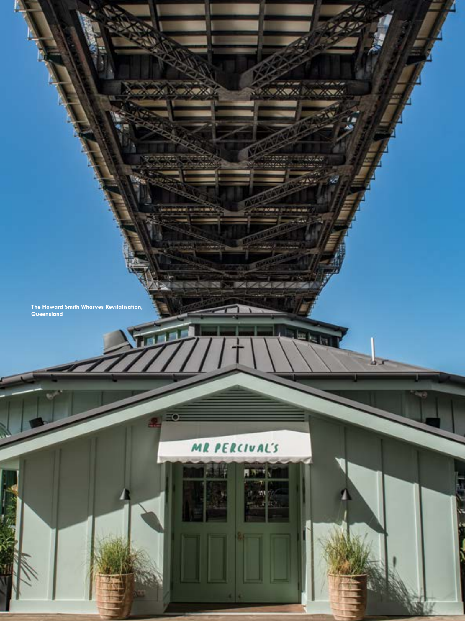
The Howard Smith Wharves Revitalisation, Queensland