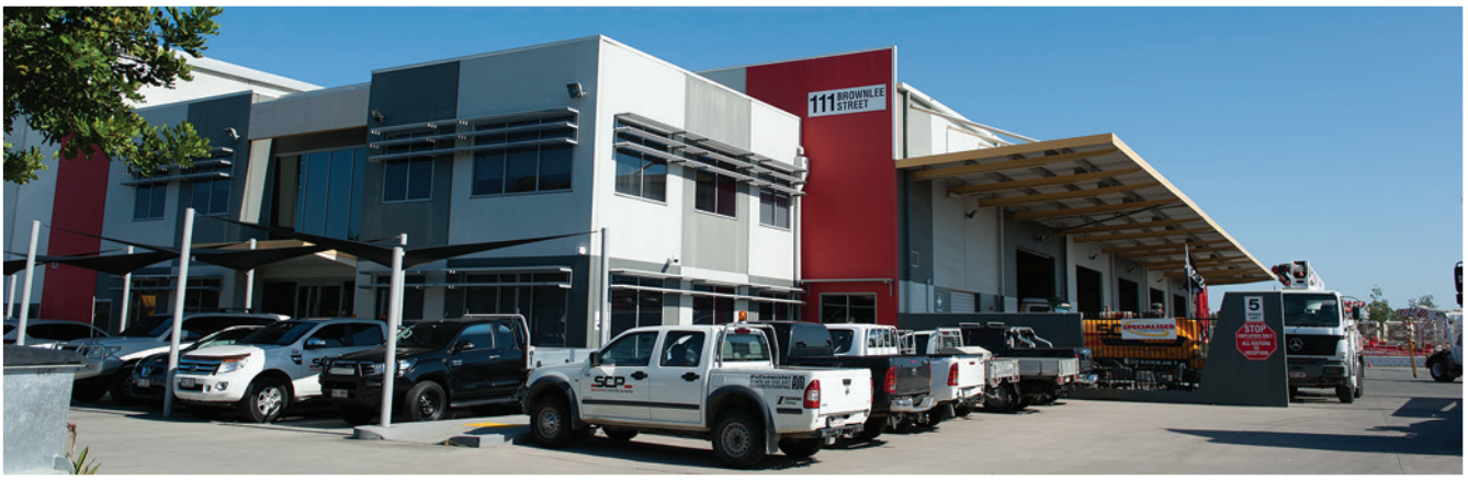
Below IRT Roofing installed the roof cladding and plumbing as well as the external downpipe system.