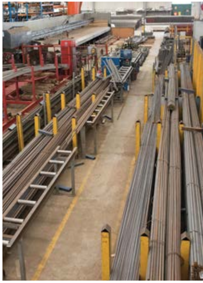
Below Herzog Steel provided 10-12 tonnes of steel each week to the SQ1 Southquay development.

Classic Scaffolding has been involved in a variety of building projects over the years but, their work on SQ1 Southquay was the company's biggest job to date. 200 tonne of scaffolding was required for the SQ1 Southquay project which was erected and maintained by Classic Scaffolding staff and subcontractors.