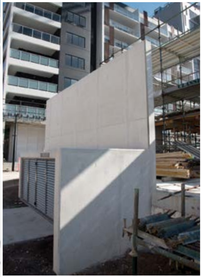
Below ACT Insulation provided high density batting and Thermobreak products for a high quality insulation finish on the project.