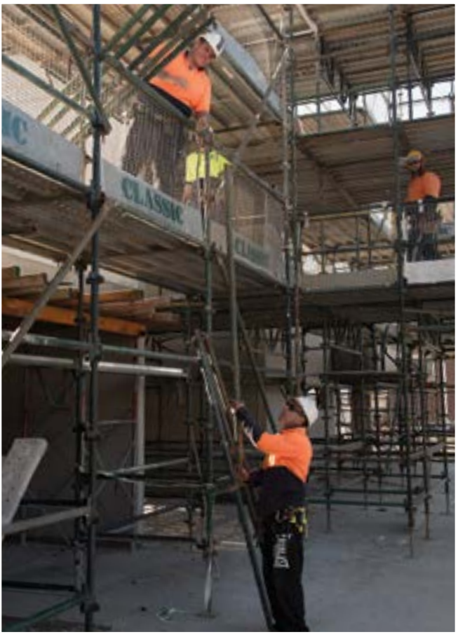
Below Classic Scaffold put up 200 tonne of scaffolding around the SQ1 Southquay project.