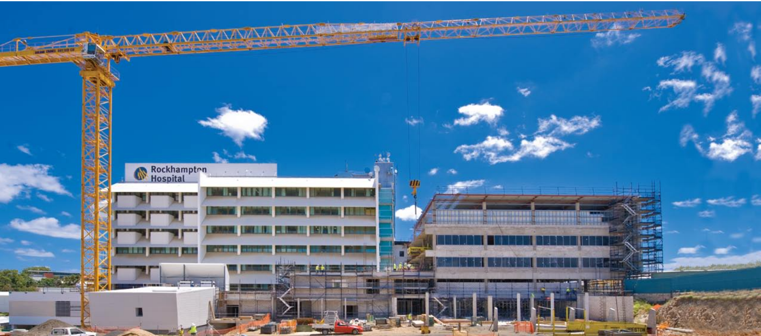
Below The long arm of Boland Cranes reaching over the construction site of Rockhampton Base Hospital.