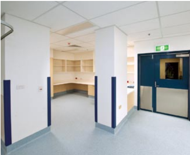
Above A sample of the painting that McAlister & Burford accomplished on the project.