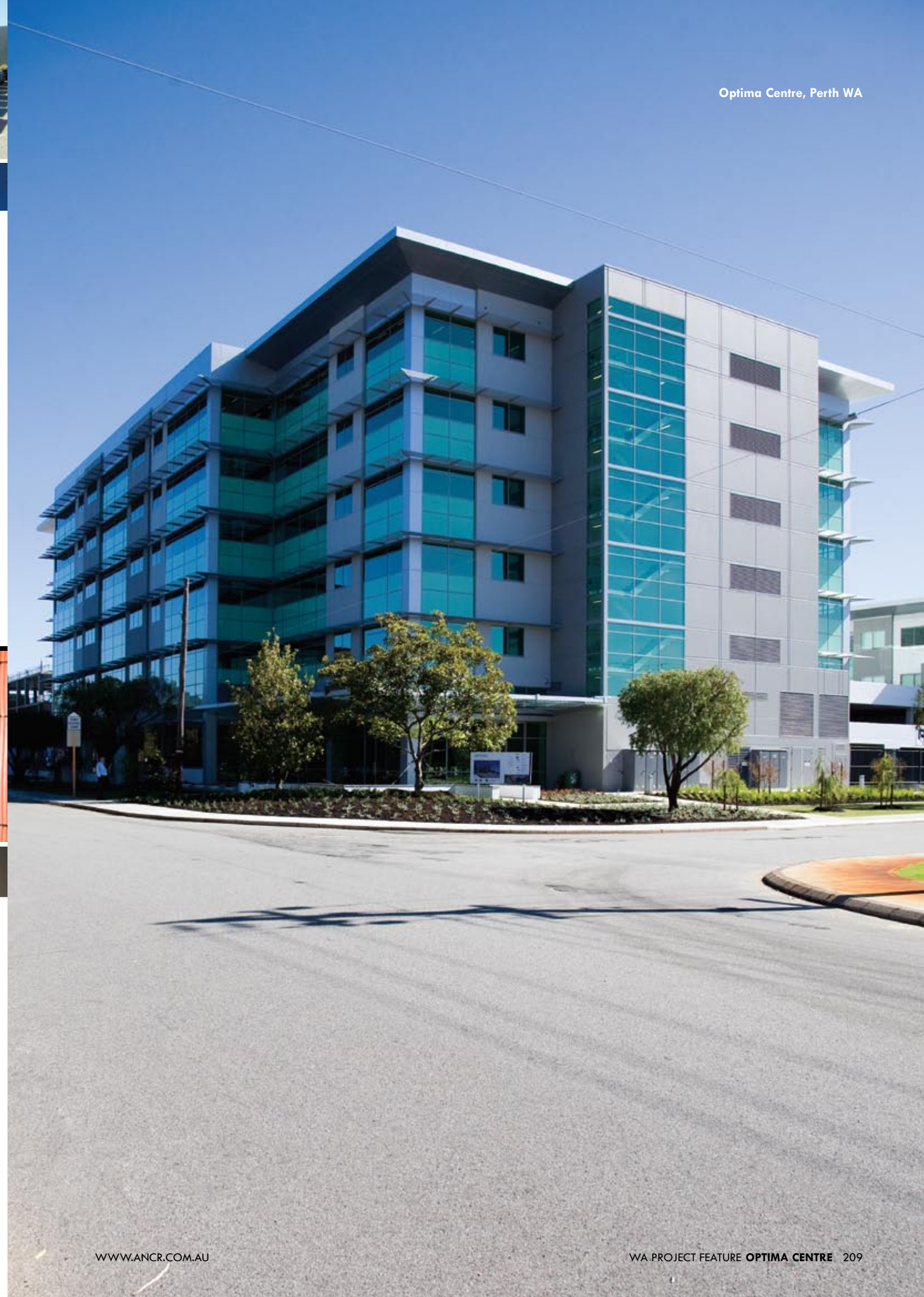
Optima Centre, Perth WA

CENTRIGRADE 7 Macadam Place Balcatta WA 6021 t. 08 9240 1992 f. 08 9240 1525 e. info@centigrade.com.au