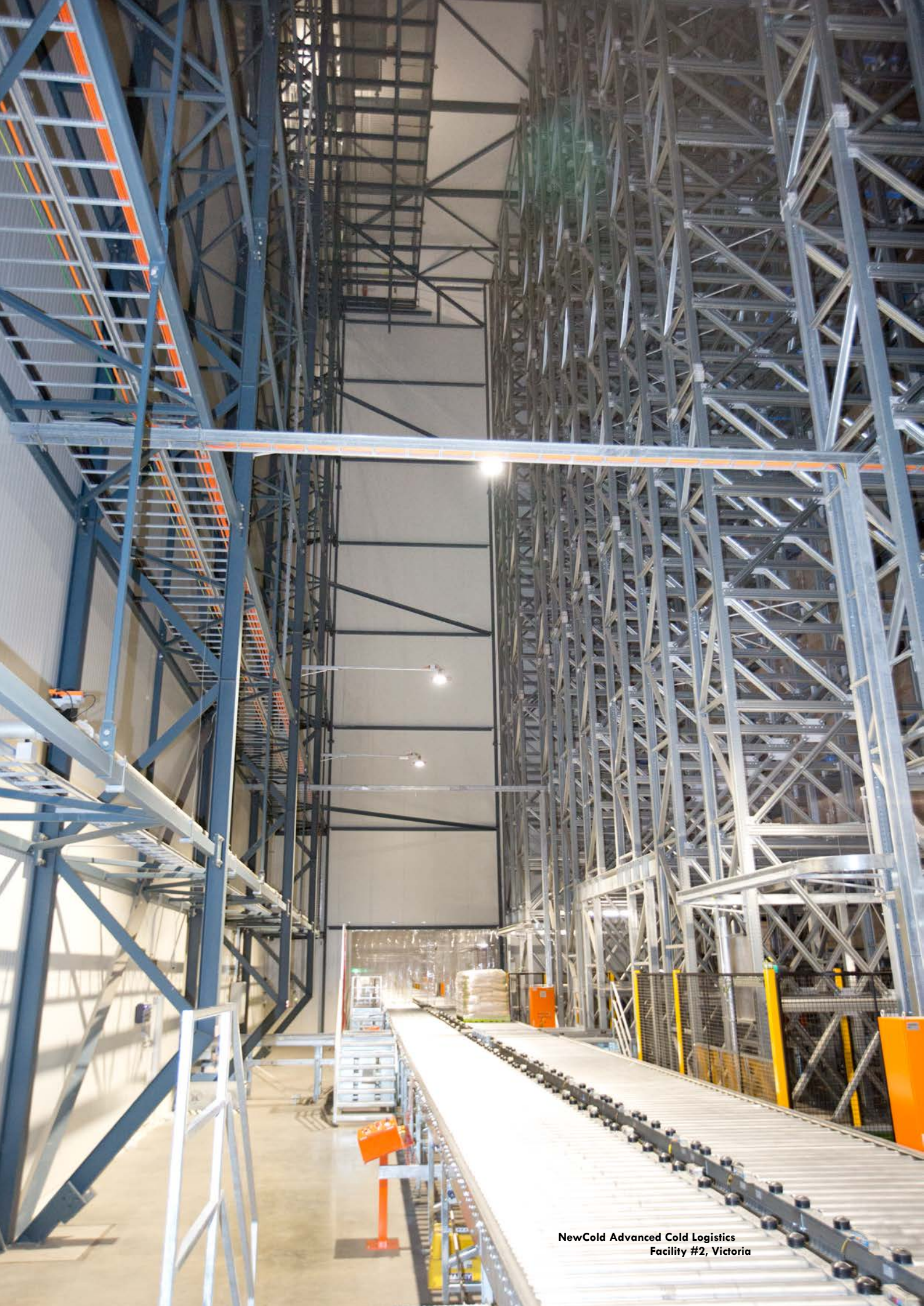
NewCold Advanced Cold Logistics Facility #2, Victoria

Below Retracom and SBP Australia, joined forces to insulate the impressive NewCold Advanced Cold Logistics Facility #2.