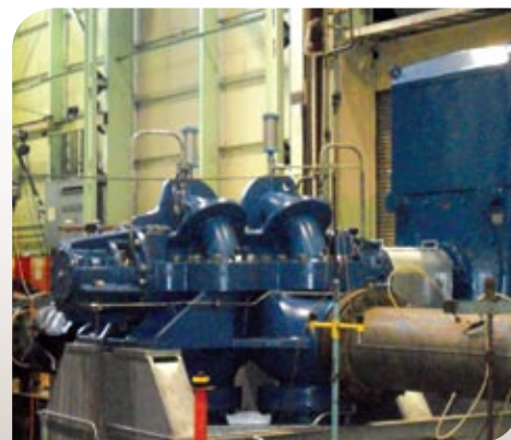
ACTEW Water's ECSD pump at test bay

Flowserve continues to be dedicated to providing an unparalleled product range and quick responses to customers throughout Australia and New Zealand.