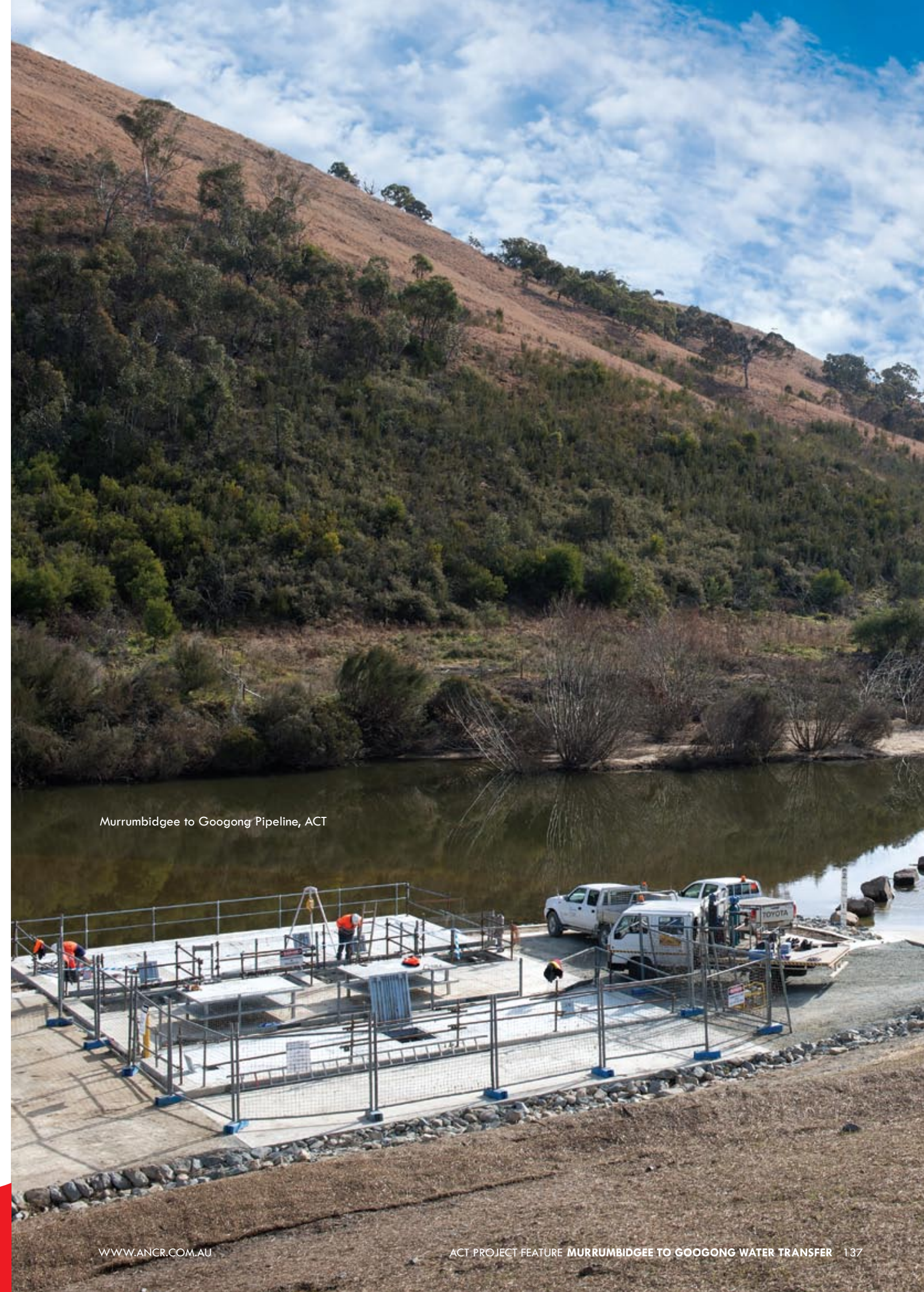
Murrumbidgee to Googong Pipeline, ACT