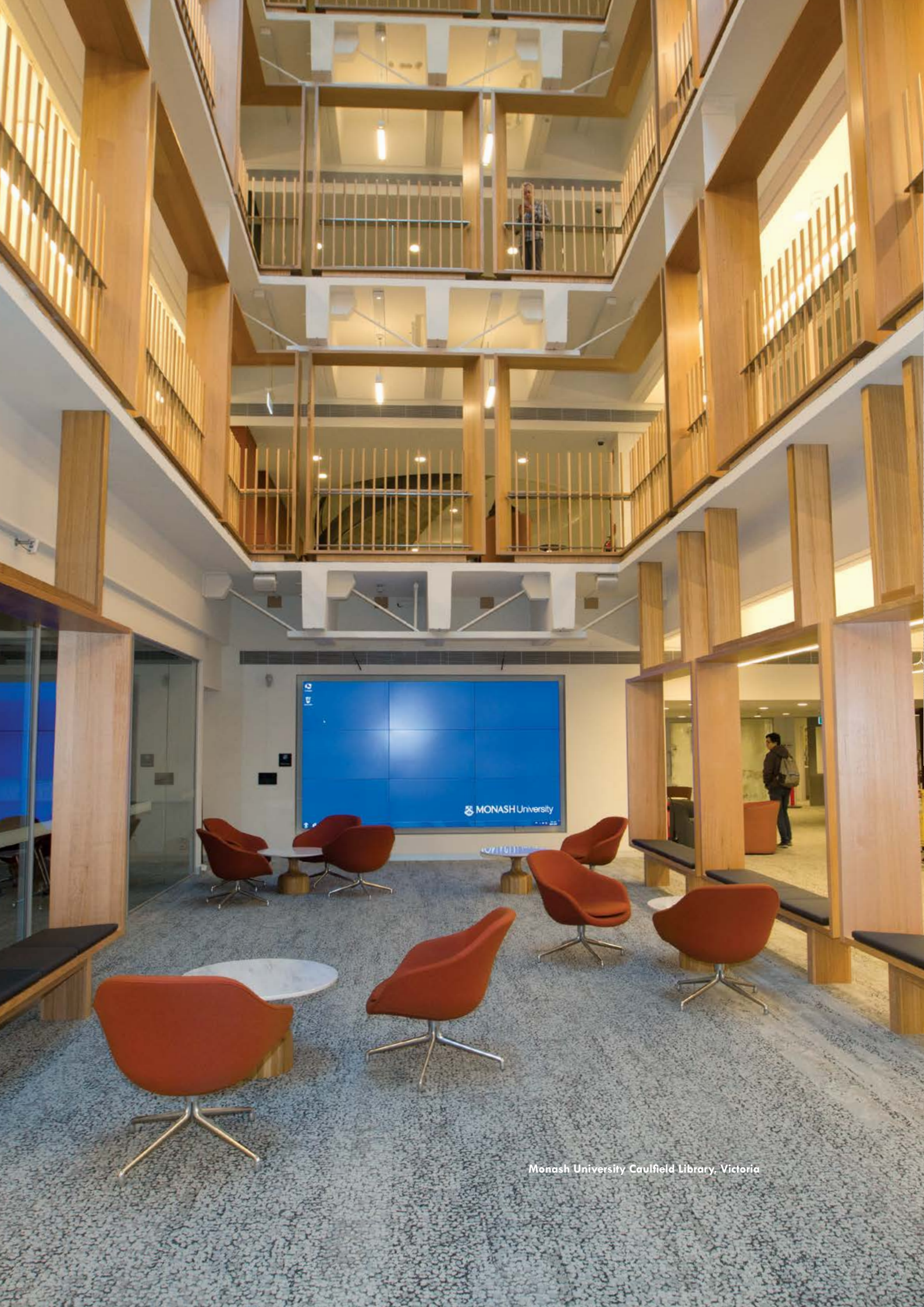
Monash University Caulfield Library, Victoria

Below Bureau Veritas HSE provided support, advice and guidance for practical solutions in relation to OH&S requirements.