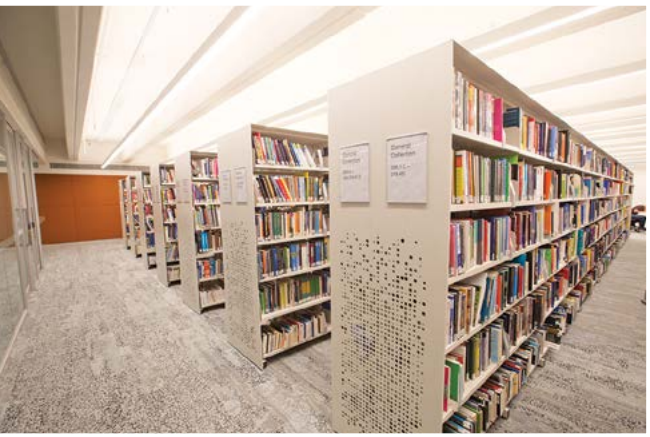
Below Raeco supplied custom shelving on four levels of the Monash University Caulfield Library project.