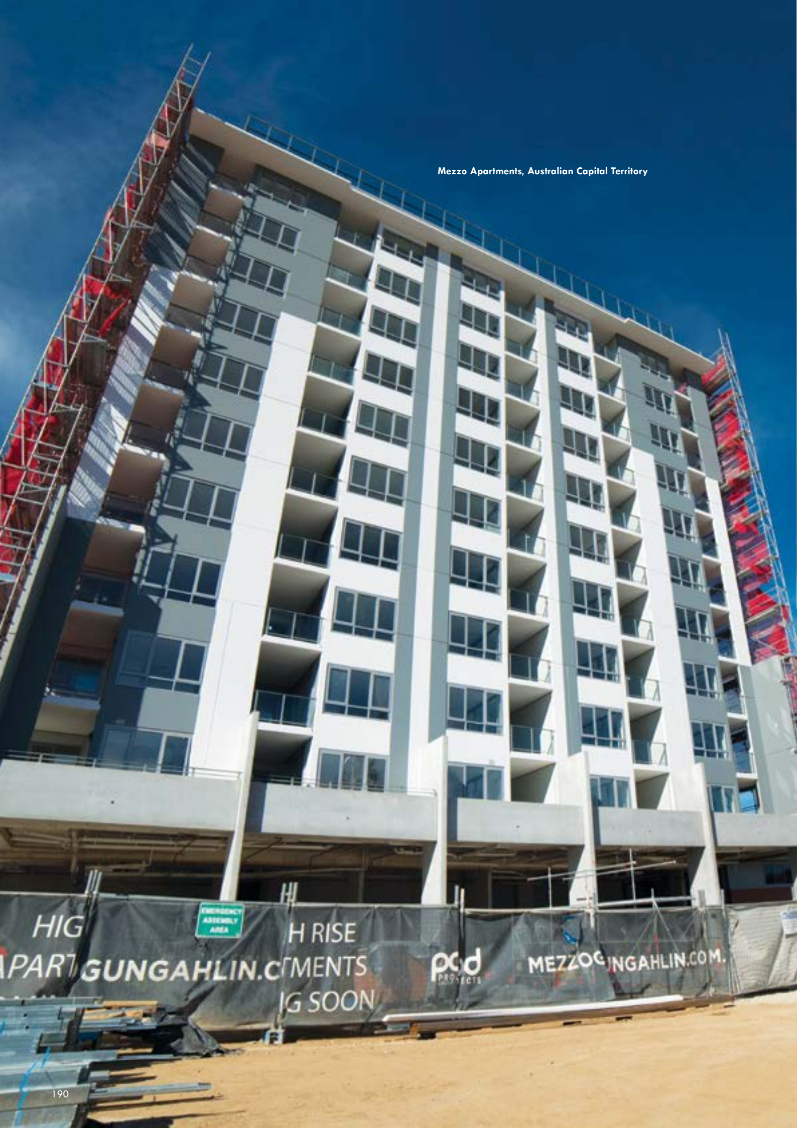
Mezzo Apartments, Australian Capital Territory