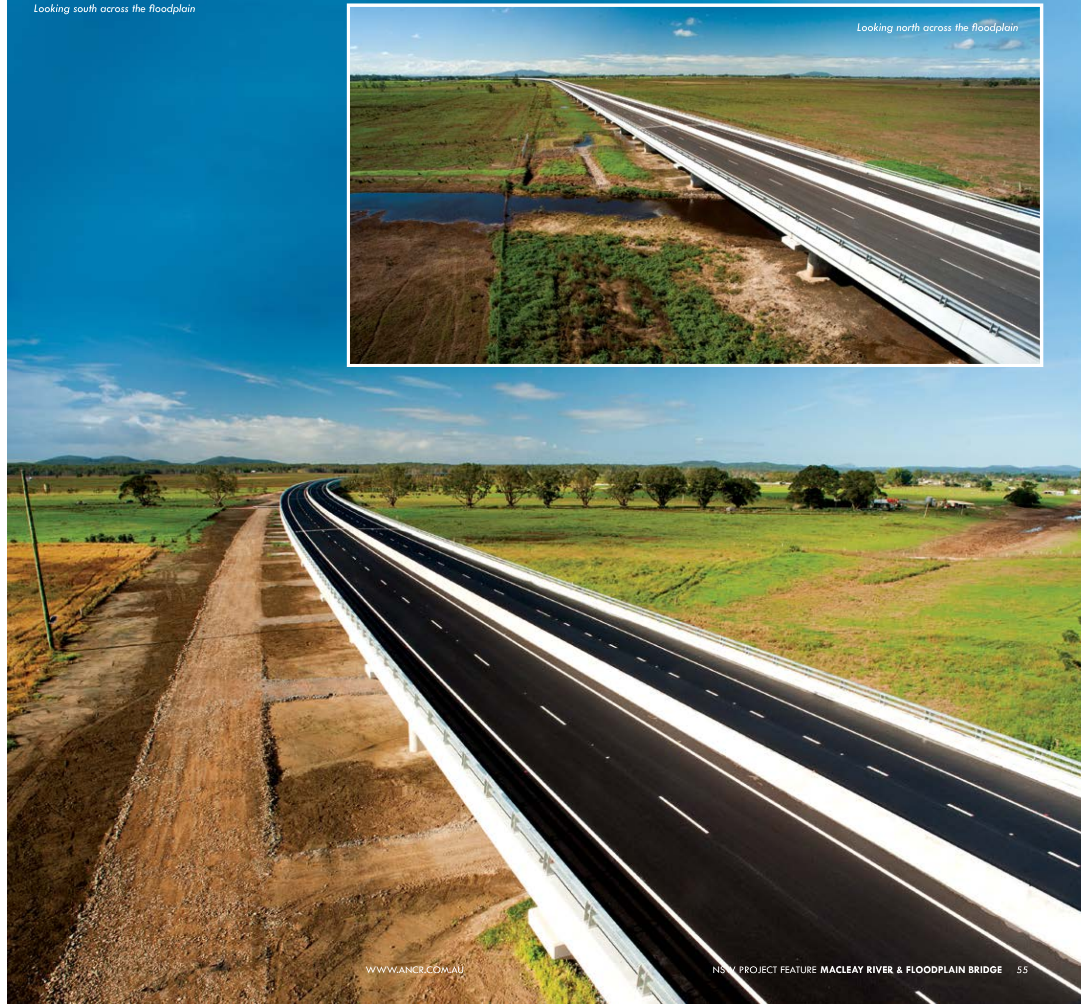
Looking north across the floodplain