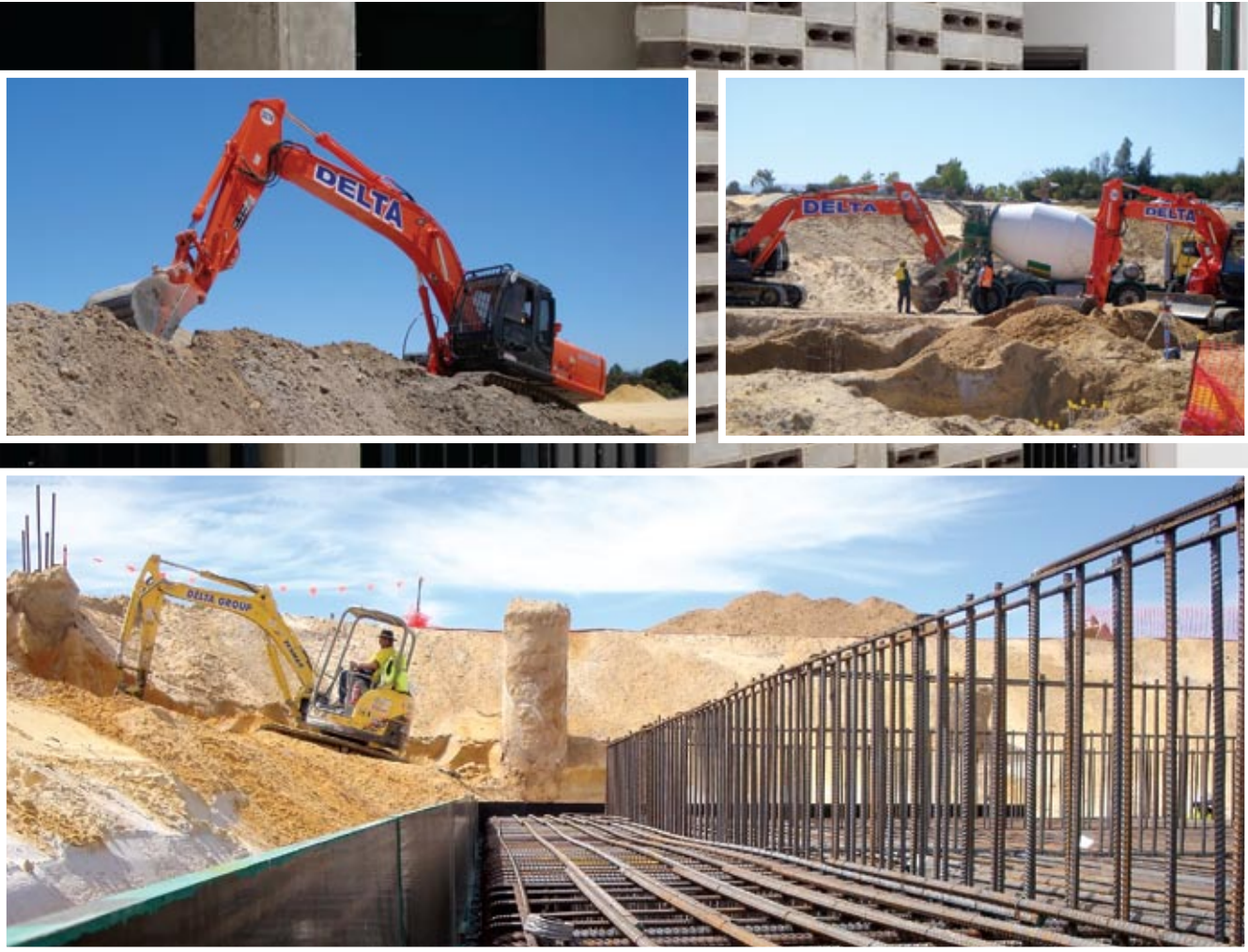
Below Delta Group provided their Demolition and civil expertise to the Lime Street project.

Delta Group were commissioned by Northerly Group to supply and place over 2000m 3 of clean fill including compaction, detailed excavation for the installation of concrete pads and footings, bulk excavation for the installation of the main elevator shaft, footings, excavation and removal of contaminated soils from the site of the Lime Street project.