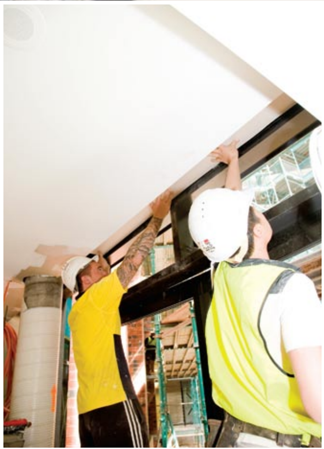
Below For the Lime Street project, Northline Ceilings designed and constructed specialised wall systems to suit the building.