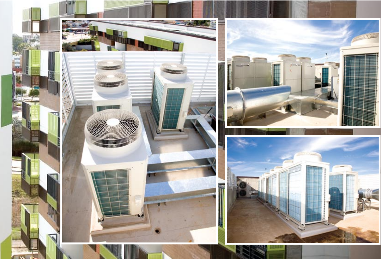
Below Haden Engineering provided the engineering and construction of mechanical services on the Lime Street project.

Haden Engineering Pty Ltd were contracted to provide the engineering and construction of mechanical services on the Lime Street project. These mechanical services included heating, ventilation and air conditioning.