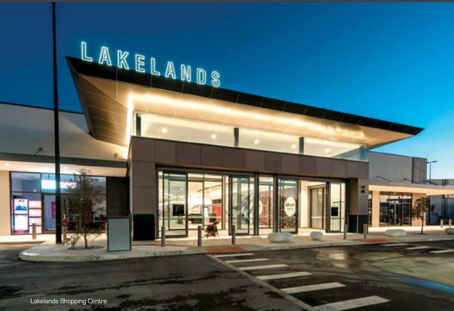
Lakelands Shopping Centre

For more information contact TES Electrical , 18 Hammond Road, Cockburn Central WA 6164, phone +61 8 9434 1514, email: admin@teselectrical.com.au , website: www.teselectrical.com.au