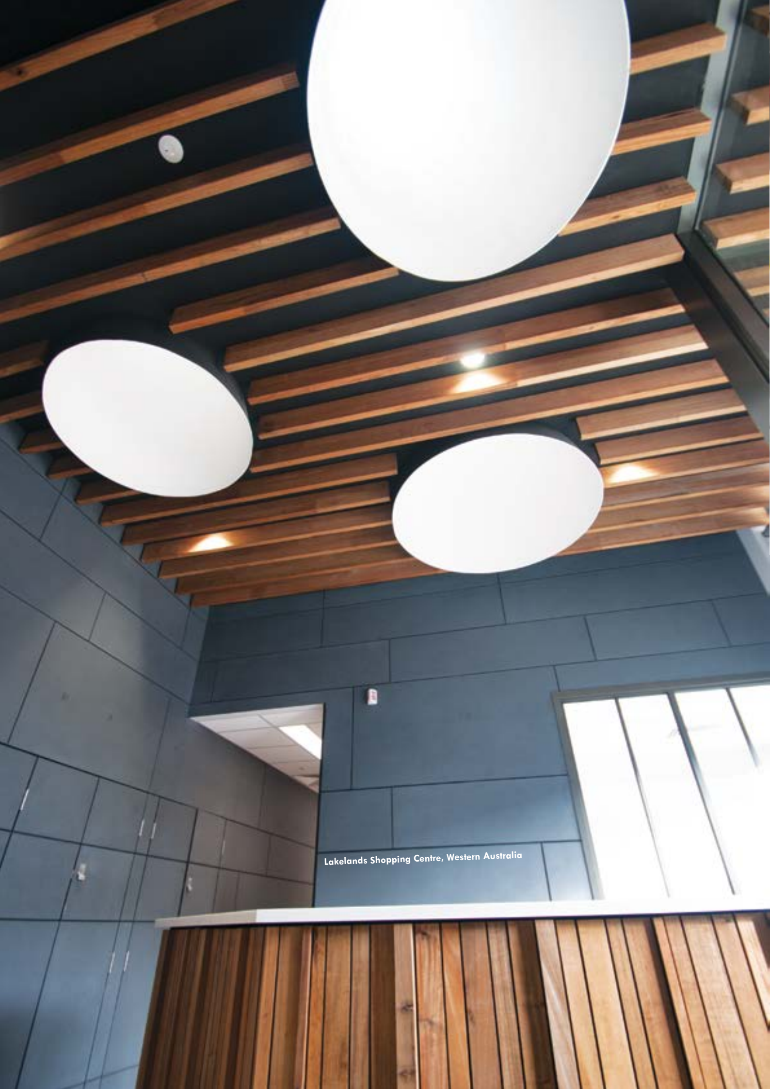
Lakelands Shopping Centre, Western Australia