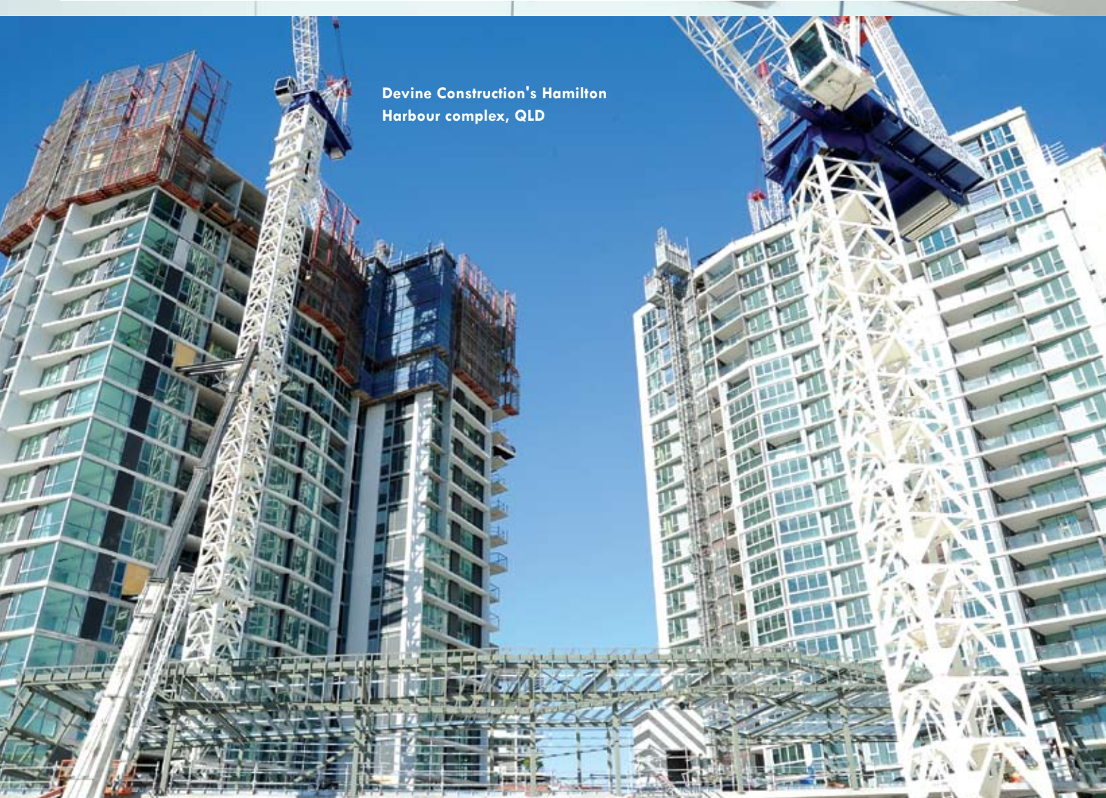
Devine Construction's Hamilton Harbour complex, QLD