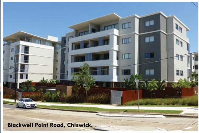
Blackwell Point Road, Chiswick.