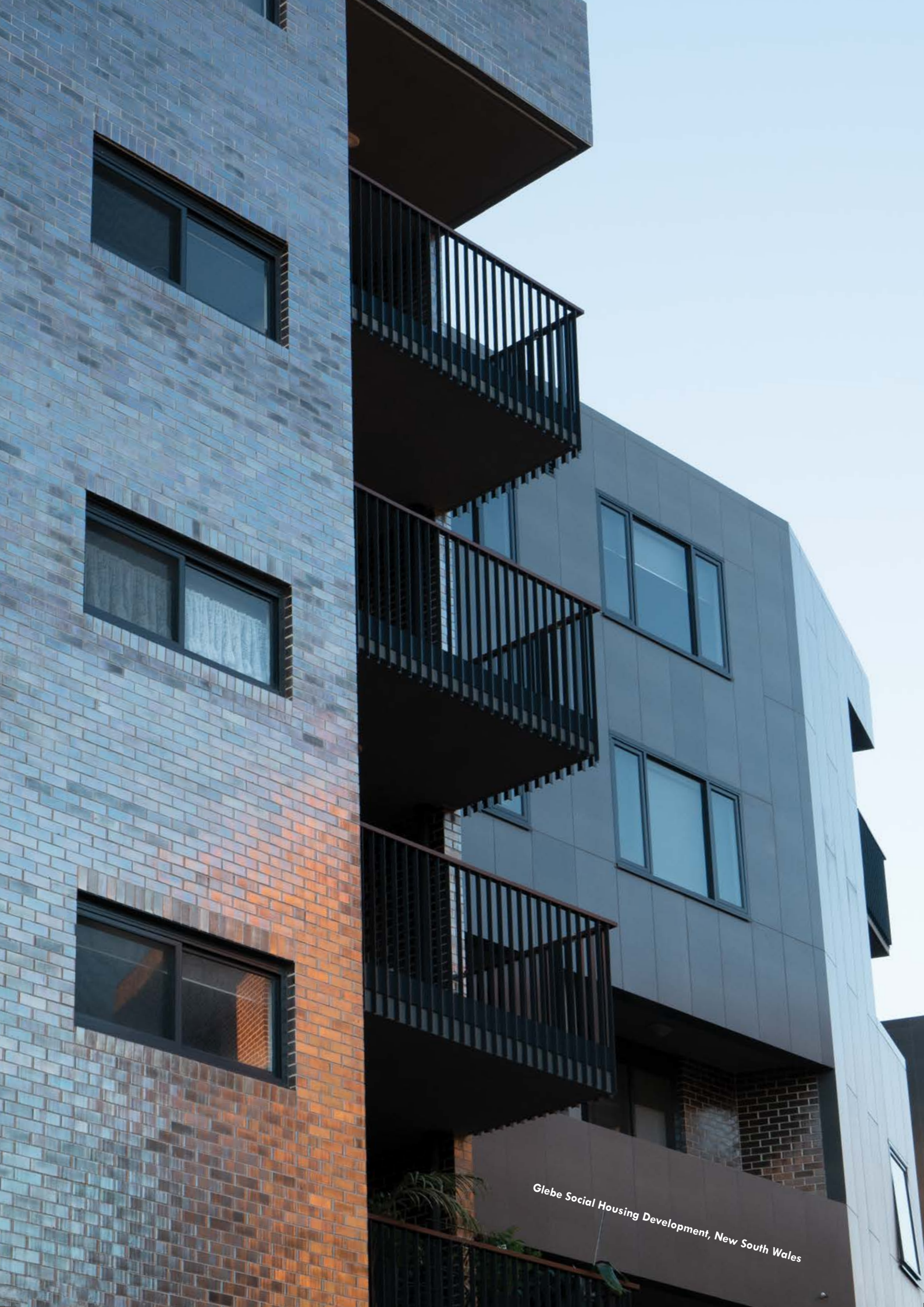
Glebe Social Housing Development, New South Wales