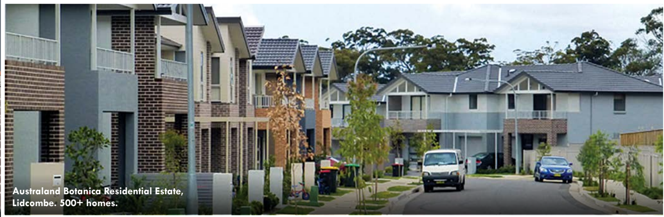
Australand Botanica Residential Estate, Lidcombe. 500+ homes.

Below Victor Lin & Associates advised on NatHERS and BASIX compliance for the Glebe Social Housing Development.