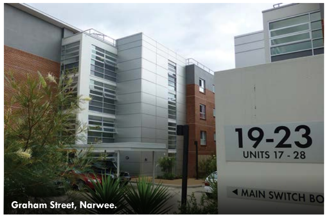
Graham Street, Narwee.

The Glebe Social Housing Development presented a unique showcase to how NatHERS and BASIX Certification should be implemented on a large project. Projects tend to leave NatHERS and BASIX assessment to just before DA. This is a dangerous approach for a large project as failure in NatHERS compliance can result in late design changes and delay DA submission. At Glebe, Victor Lin & Associates was engaged at design stage and provided valuable advice on NatHERS and BASIX compliance. Their services resulted in the solving of many compliance issues before they caused any delay to the DA process.