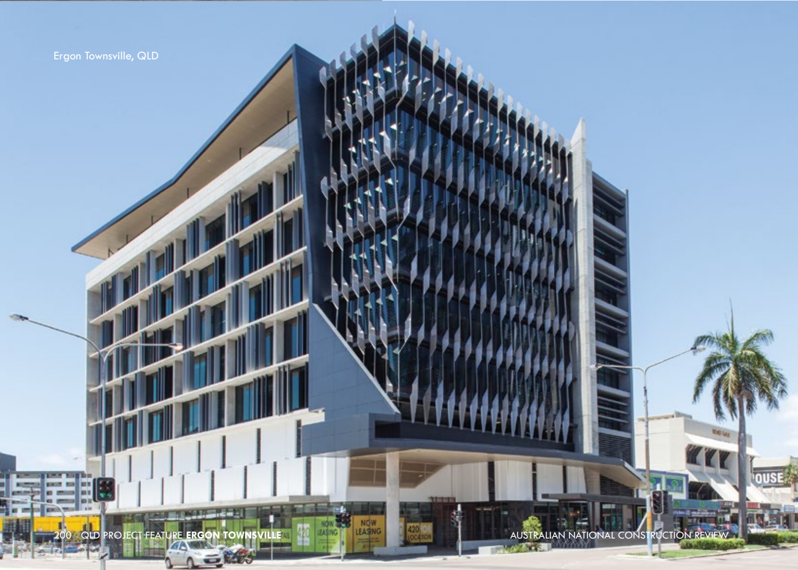
Ergon Townsville, QLD