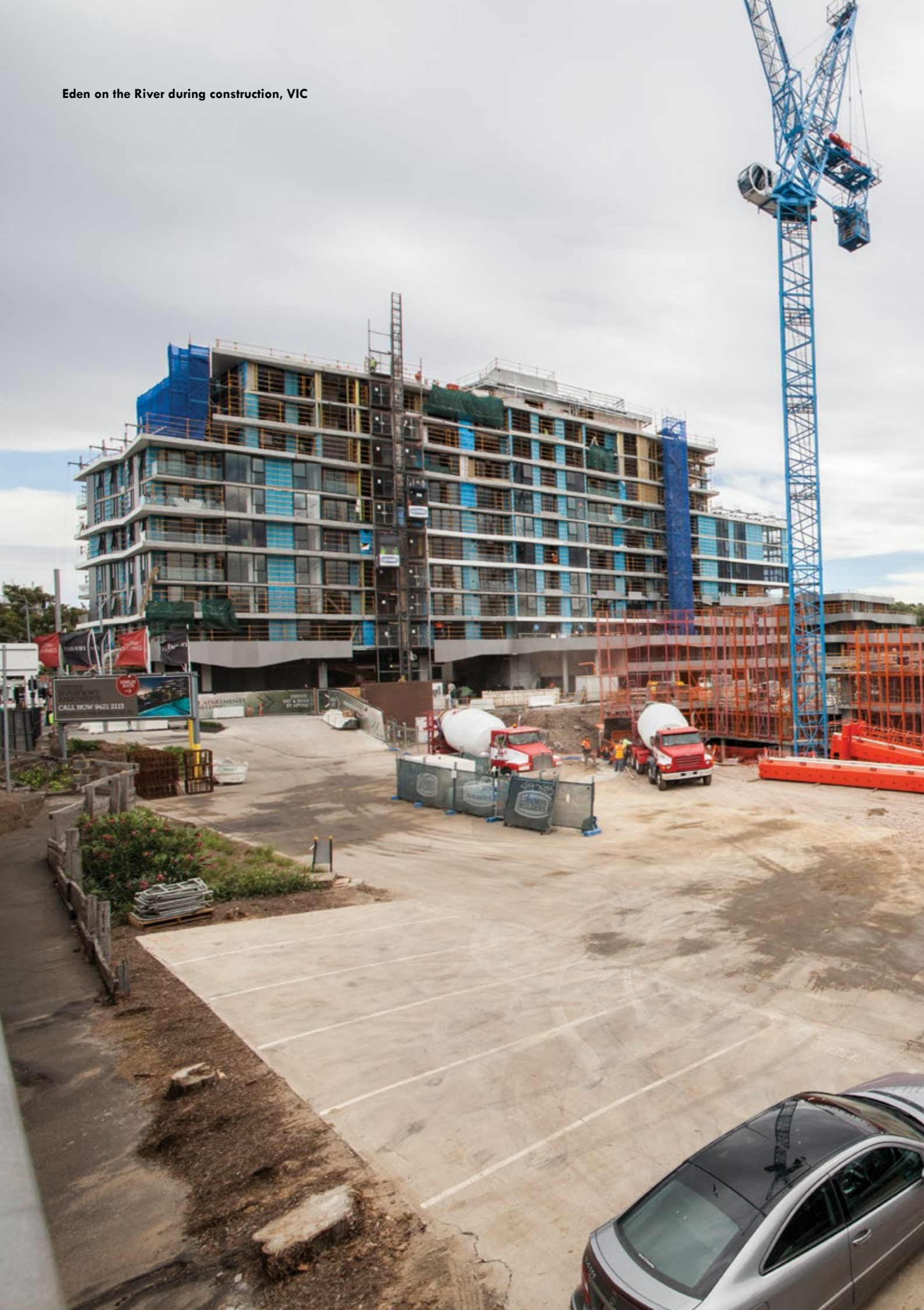
Eden on the River during construction, VIC