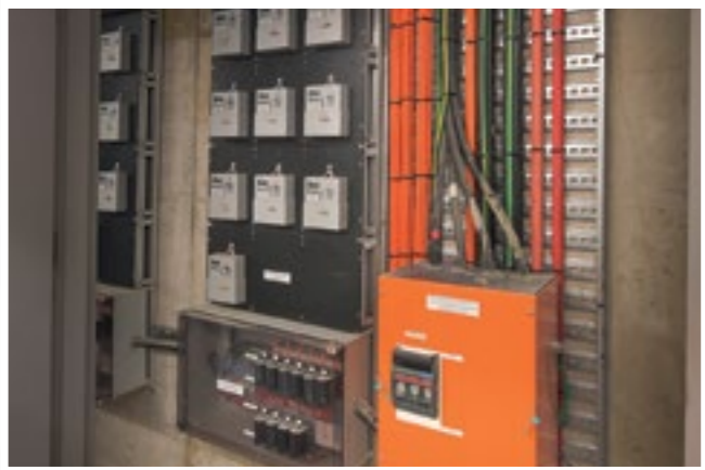
Below Dynamite Electrical Services were responsible for all of the electrical systems at Divercity.