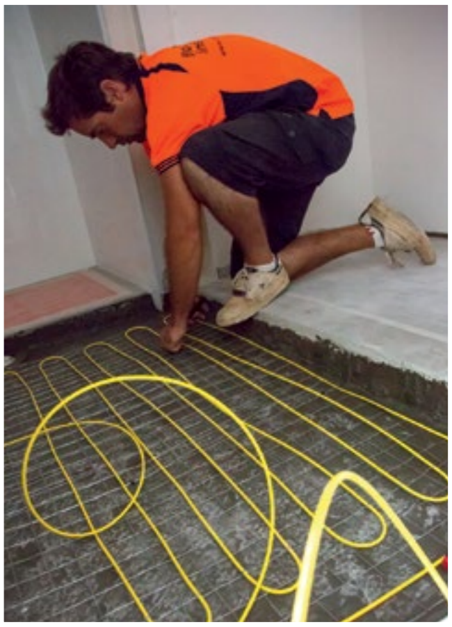
Below Comfort Heat Australia provided selected apartments with silent, invisible and clean floor heating at Divercity.

“Around 90% of our work is hidden,” explains Theo Theodorou from Dynamite Electrical Pty Ltd. “They just see a light switch or light but don’t realise the amount of work it takes.”