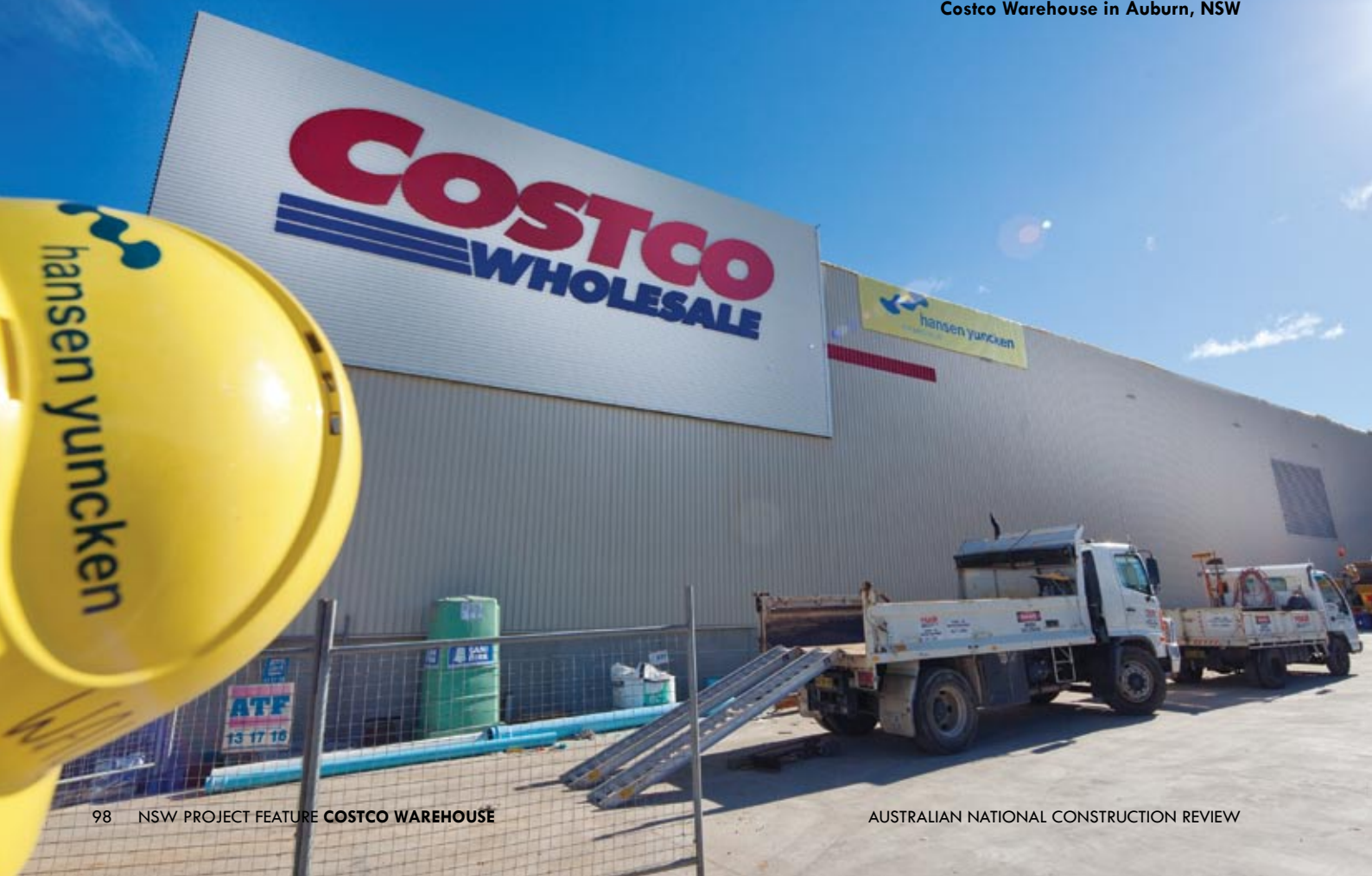
Costco Warehouse in Auburn, NSW