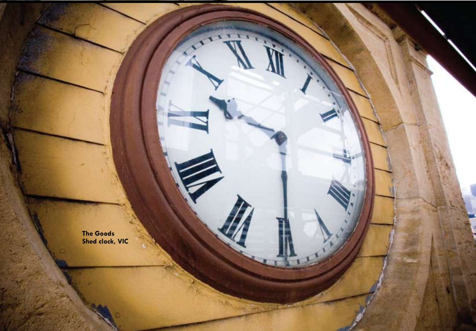
The Goods Shed clock, VIC