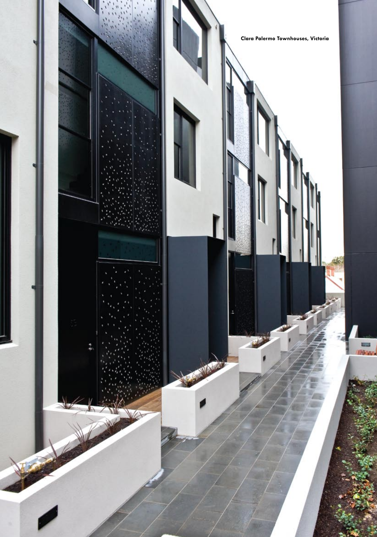
Clara Palermo Townhouses, Victoria