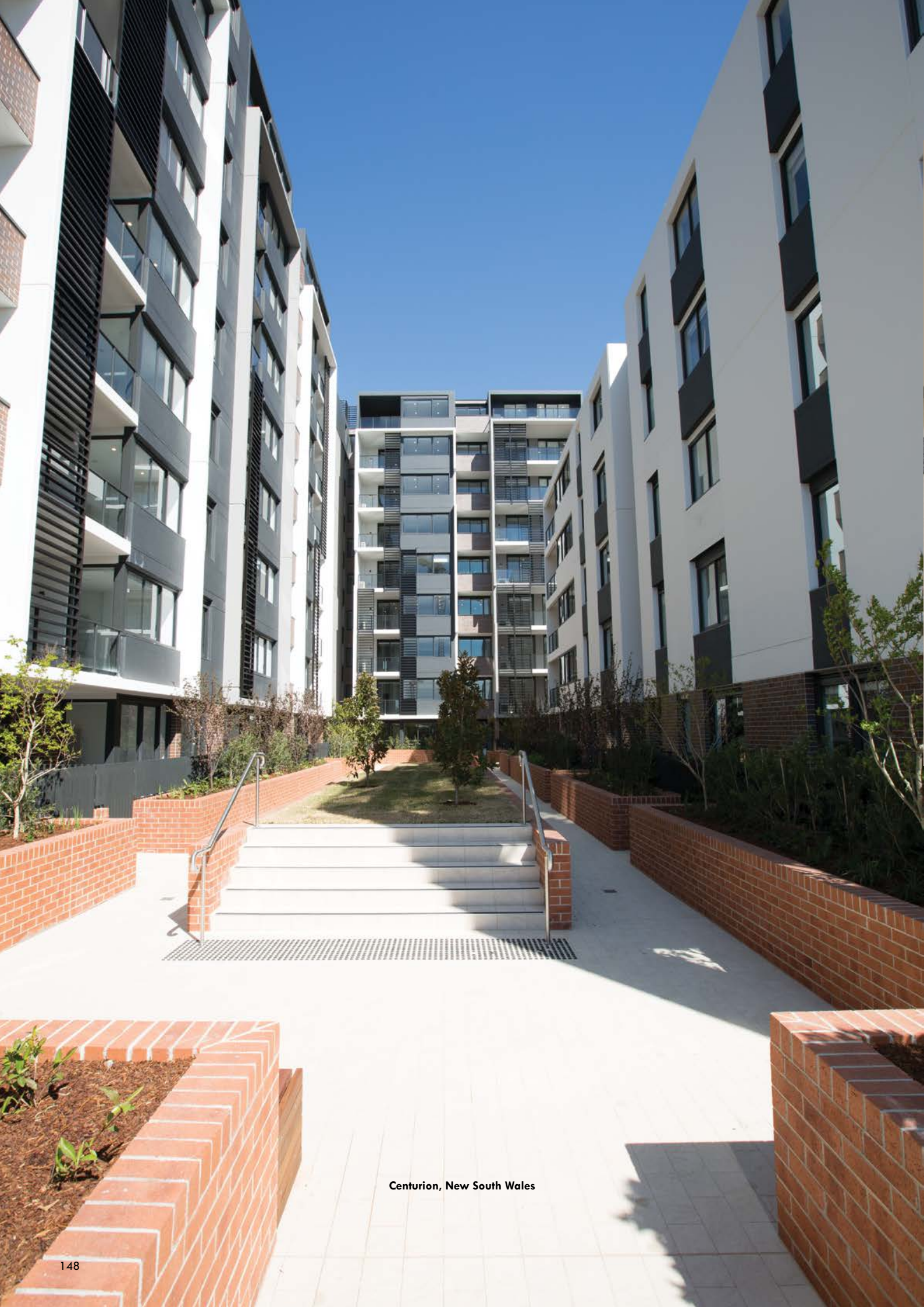
Centurion, New South Wales

Below Classic Architectural Group supplied and installed quality floor safety products and carpark safety solutions.