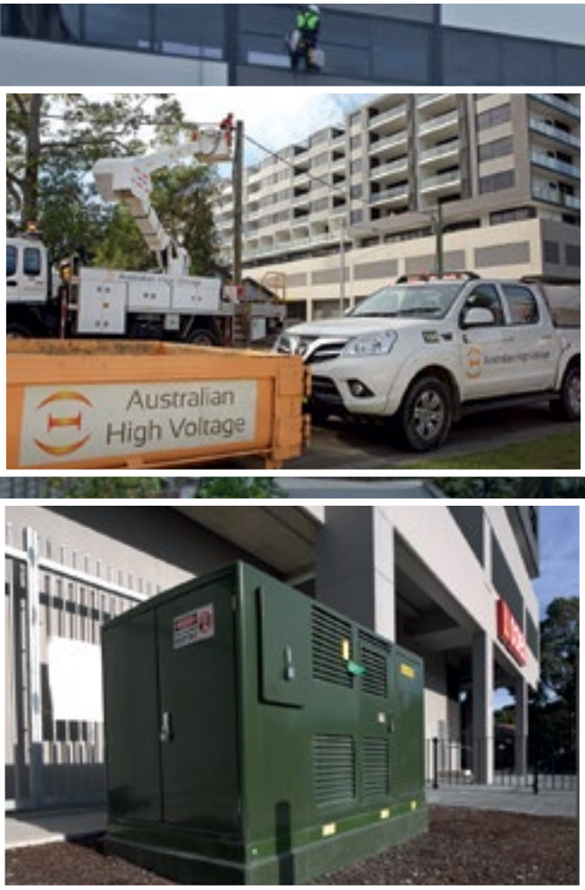
Below Australian High Voltage connected the electricity network on the Central Square project.