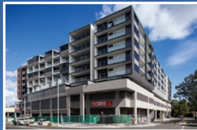
DEVELOPER : Toga Pty Ltd ARCHITECT : Anthony Vavayis & Associates Pty Ltd ENGINEER : Meinhardt Pty Ltd PROJECT VALUE : $100 Million

For more information contact Toga Group of Companies Pty Ltd, Level 5, 45 Jones Street, Ultimo NSW 2007, phone 02 9356 1000, fax 02 9360 7769, email info@toga.com.au, website www.toga.com.au