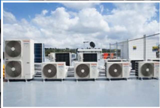
Below A1 Best Group installed the heating, ventilation and air conditioning systems on the Central Square.