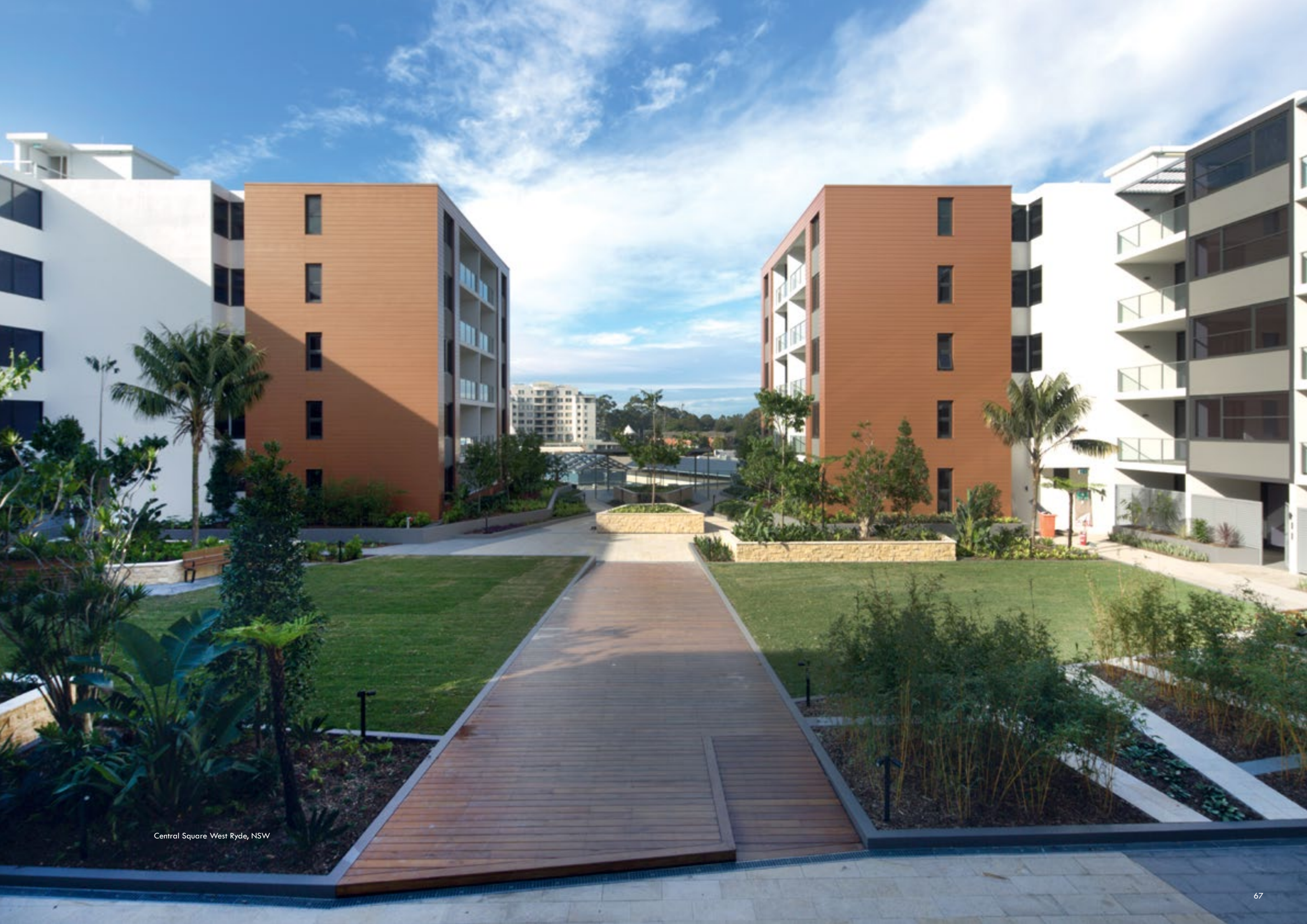
Central Square West Ryde, NSW