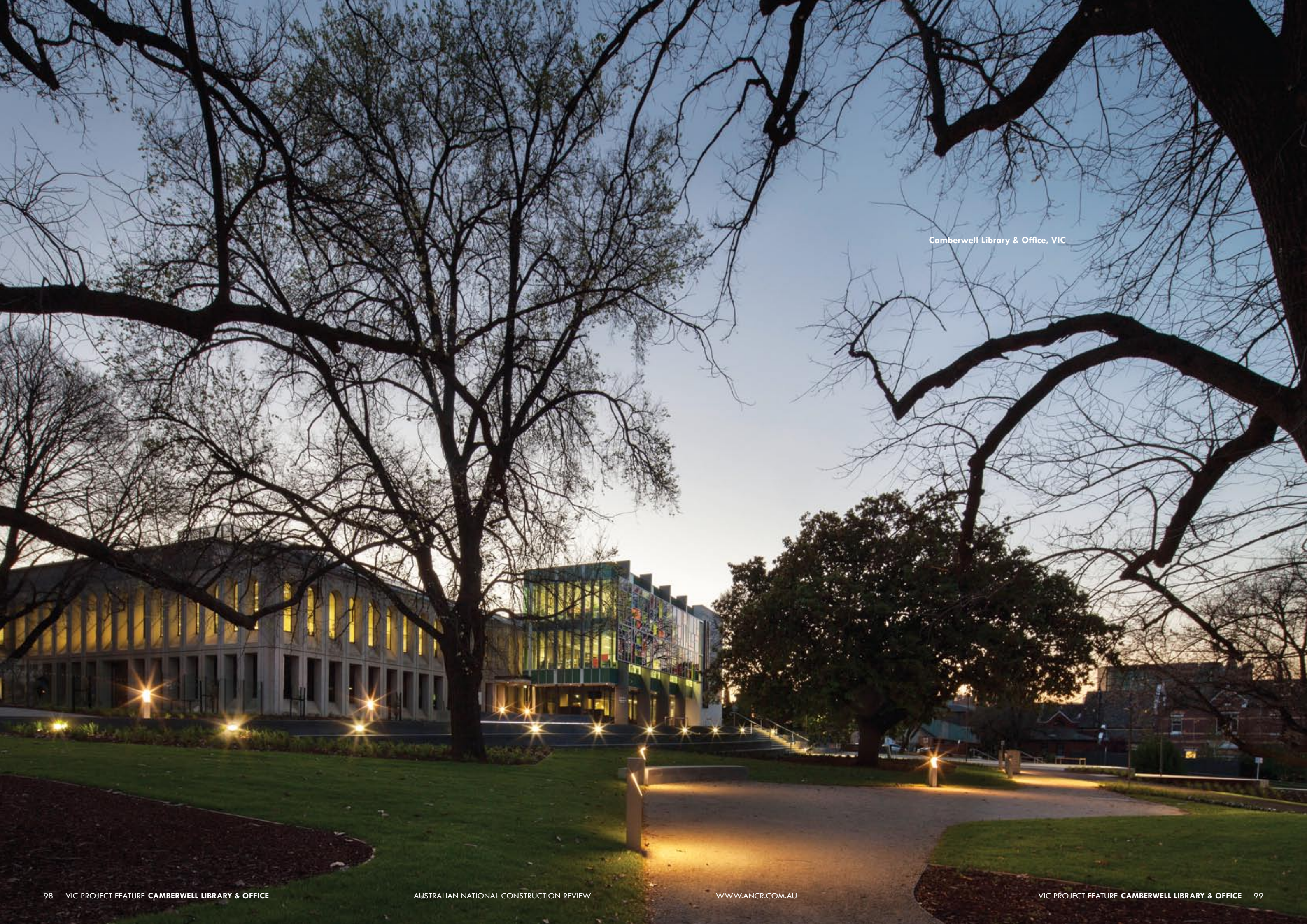
Camberwell Library & Office, VIC