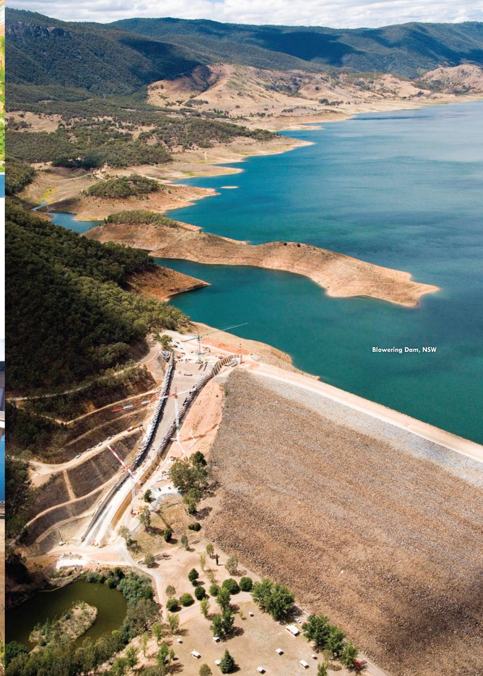
Blowering Dam, NSW