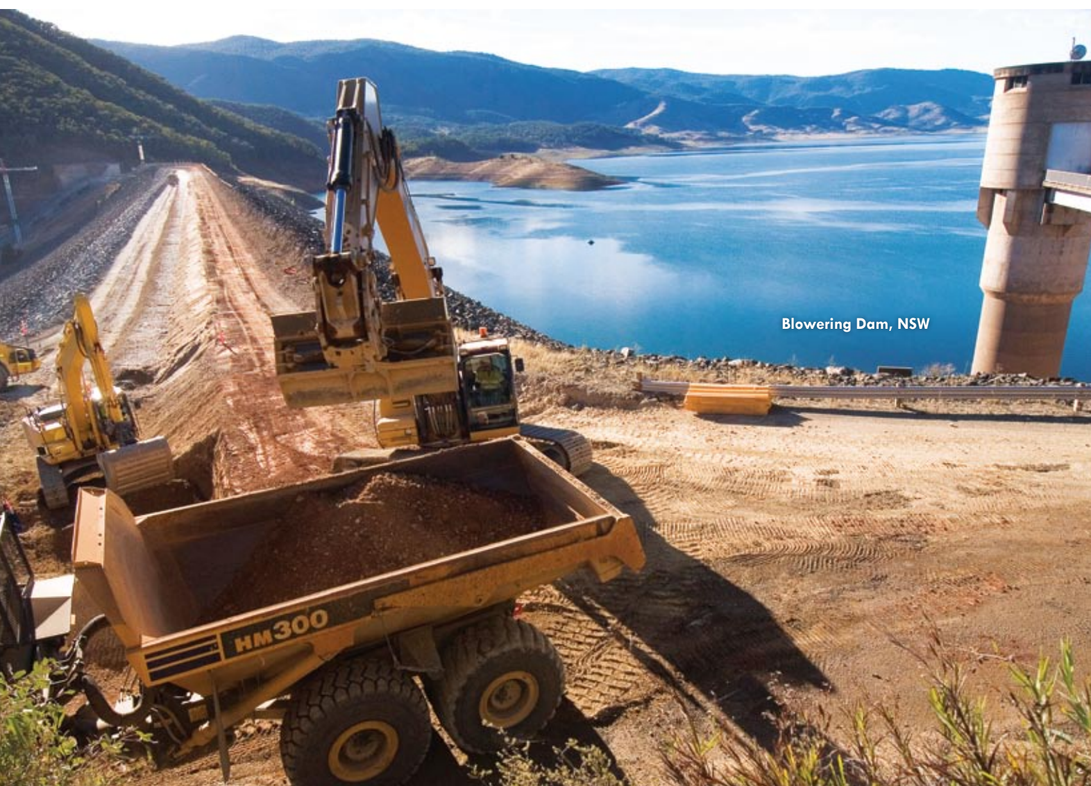
Blowering Dam, NSW

MCDUGALL & CRUISE PTY 26 Russell Street Tumut NSW 2720 t. 02 6947 1624 / 02 6947 1184 f. 02 6947 3751 e. info@mcdchome.com www.mcdchome.com