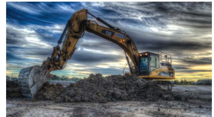
Image Daracon's involvement on the project included civil works, demolition, remediation, and construction of 1.7km of new rail track.

"There were some particular challenges, including placing the VENM clay cap adjacent to the Hunter River, as we needed to prevent runoff, effectively ensuring a nil discharge scenario. We also had four friable asbestos discoveries, amounting to a total of 11,000m 3 of friable asbestos contaminated fill. We ensured a strict protocol of isolation, whereby we engaged Enviropacific Services to instigate air quality and occupational hygiene monitoring for the duration of the removal. "We were careful to control plant movement throughout remediation works, distinguishing between clean plant and dirty plant (working in contaminated areas). In one location pulling out 5,000m 3 of coal tar, we constructed wheel washes and a designated wash down area. The general site induction also included information on the contaminants."