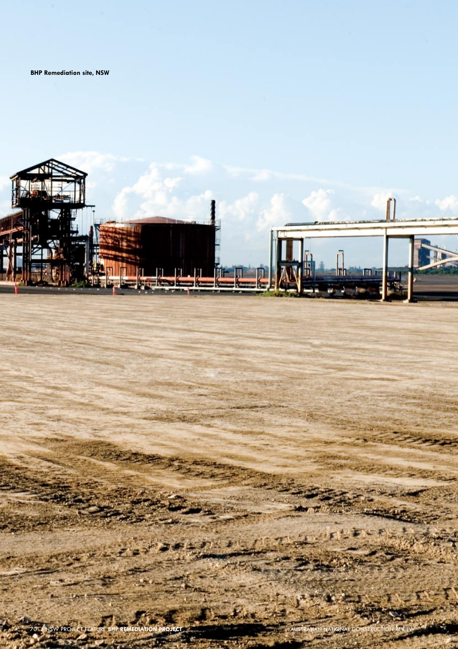
BHP Remediation site, NSW