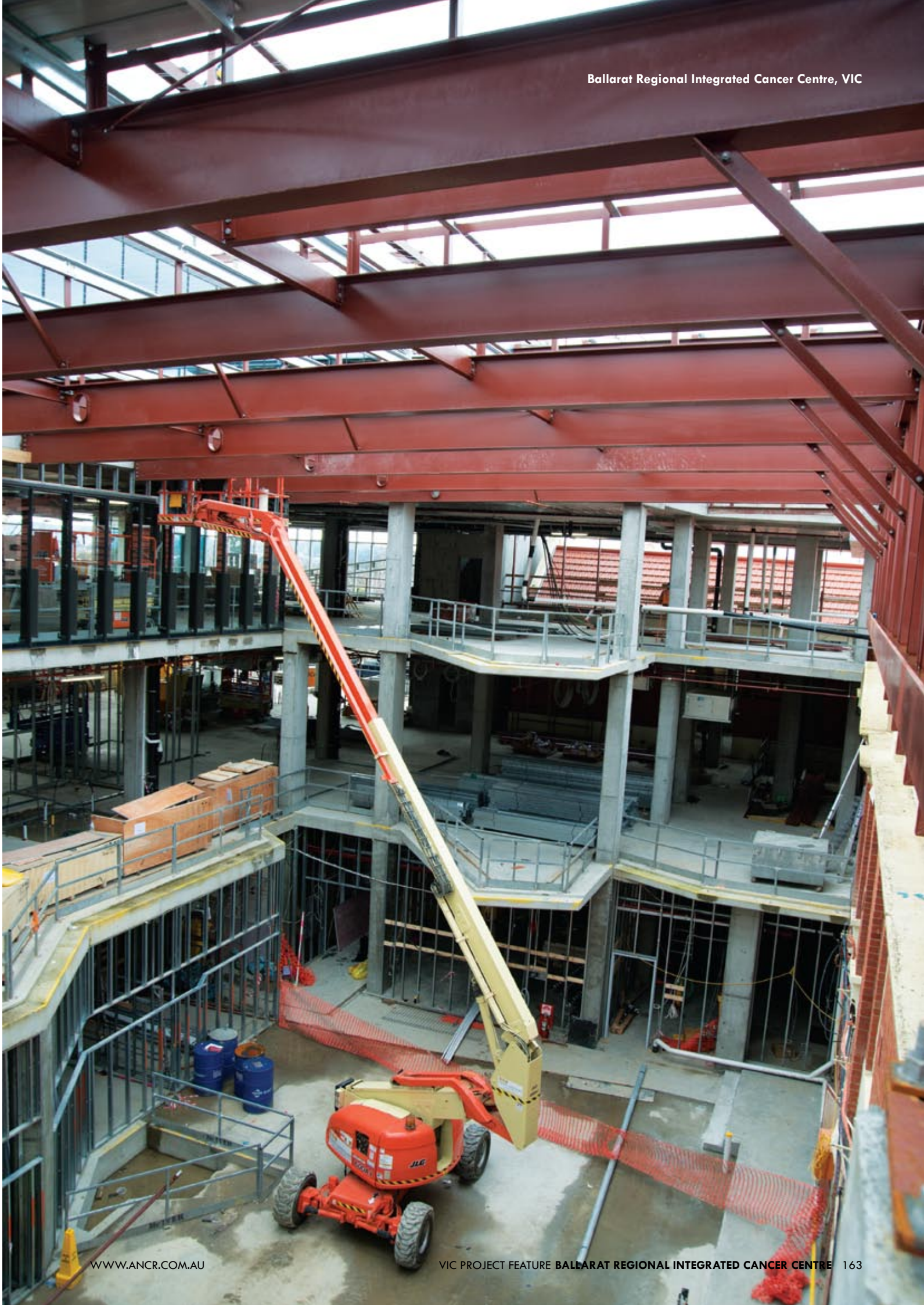
Ballarat Regional Integrated Cancer Centre, VIC