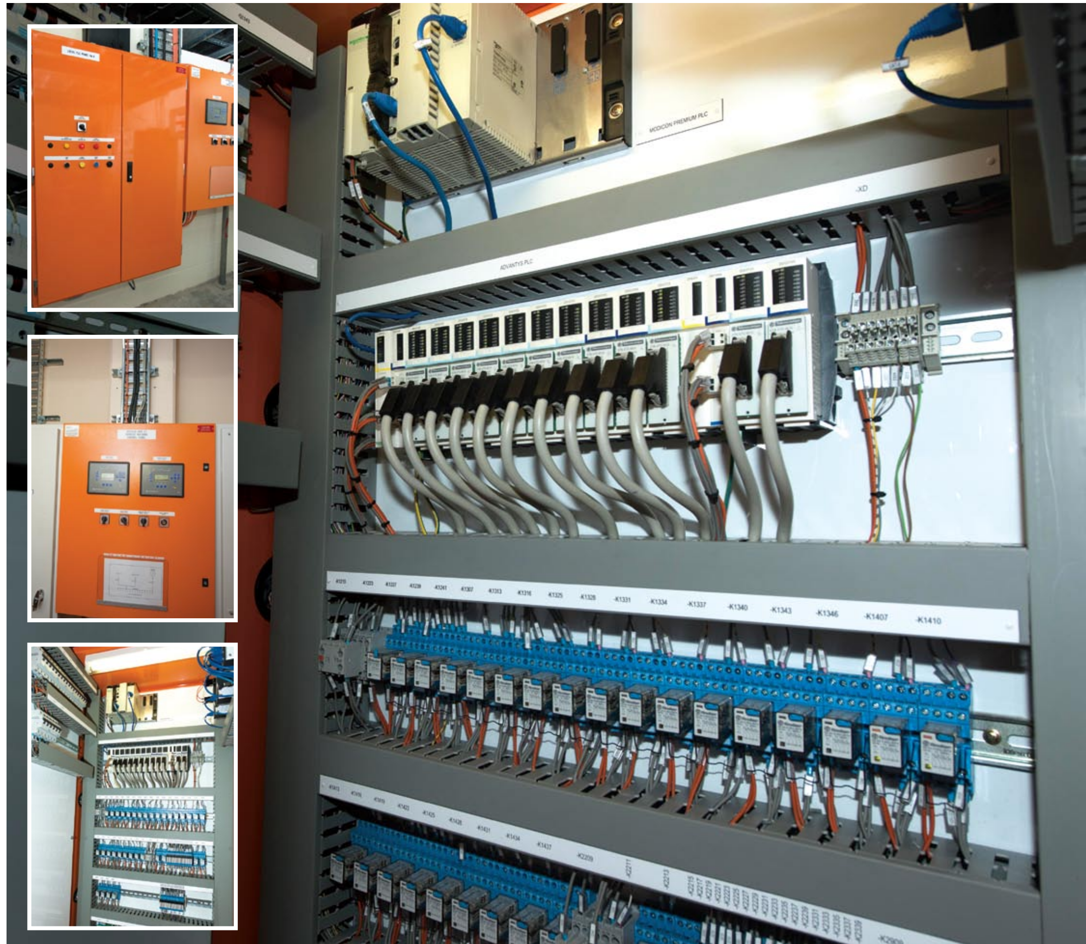
Below System Insight's extensive work on the Ballarat Regional Integrated Cancer Centre project.

For more information contact Systems Insight Pty Ltd, 15 Eastlink Drive, Hallam, VIC, 3803, phone 03 9796-4002, fax 03 9796-4003, email: mail@systemsinsight.com.au