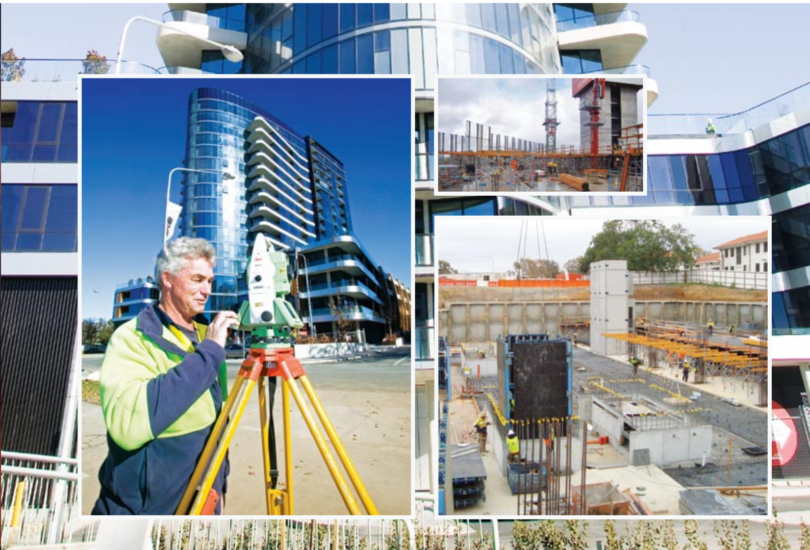
Below I.C Formwork's experience in solving construction challenges provided solutions for buildings of unique architecture such as NewActon.

Their name sums them up: Professional Tiling Services (PTS); and for over a year they gave The ApARTments at NewActon South the same level of scrupulous workmanship with quality materials which have made them a preferred subcontractor for some of the ACT's most discerning commercial builders and private clients. Their highly skilled crews of tilers, stonemasons, waterproofers and labourers installed all tiling, waterproofing and wet area feature stone work for the internal units, including the supply and installation of Smart stone to bath surrounds and waterproofing and paving to balconies. They also supplied and installed Bluestone to the common areas lobby floor and feature walls, and stone to the lift façades.