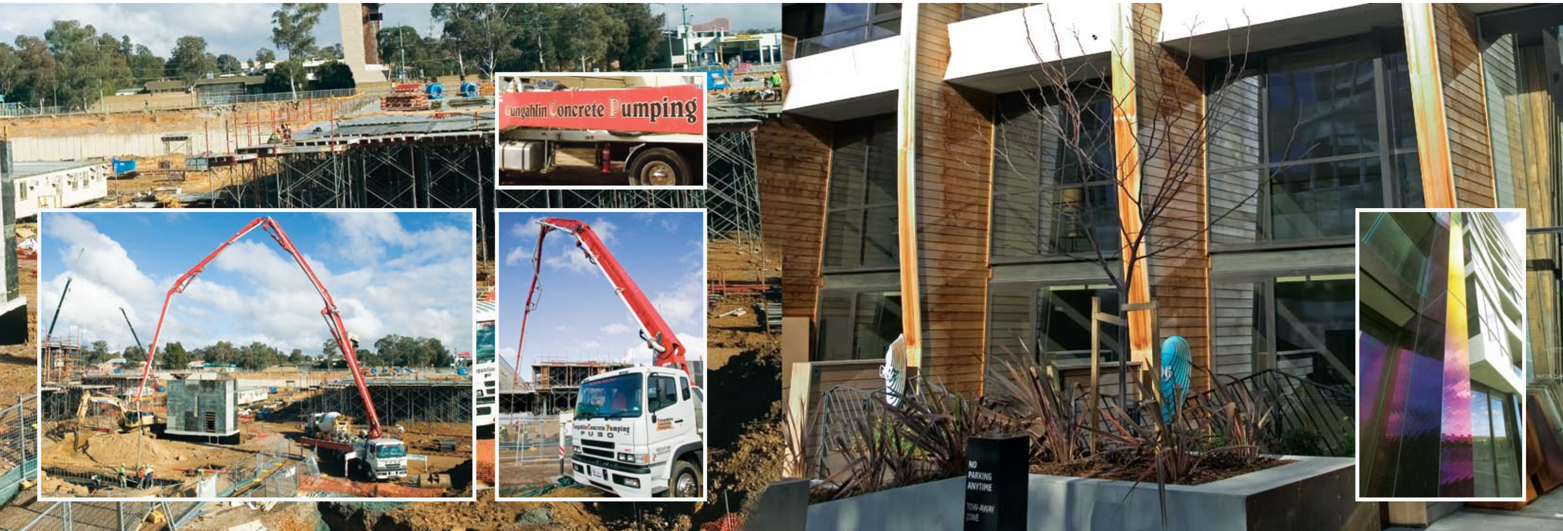
Below Erincoole Building Services were responsible for the Rimex feature fin and the beautiful timber façades.

Everything about the NewActon Stage Two project was challenging – the architecture, the scale of the project, and the timeframe. For Gungahlin Concrete Services (GCS), who undertook the pumping, placing and finishing of concrete for the 18 level tower, podium and external areas, this job represents new realms of achievement.