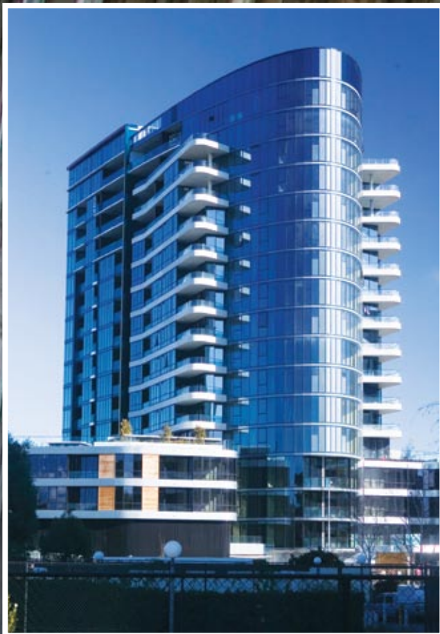
Main The foyer reflects the beautiful co-operation between craftspeople, contemporary artists and specialist designers. Inset The shimmering exterior of NewActon - The ApARTments.