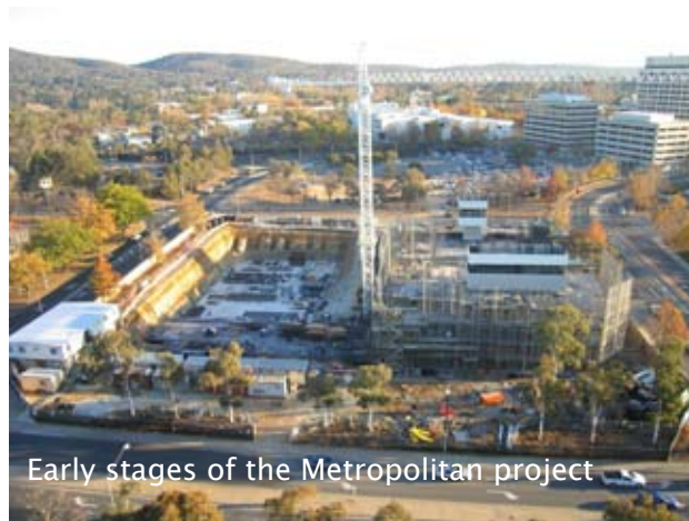
Early stages of the Metropolitan project

Its uniquely simple, interlocking 'tongue and groove' system reduces installation time, generating cost savings to projects. Each panel neatly interfac-