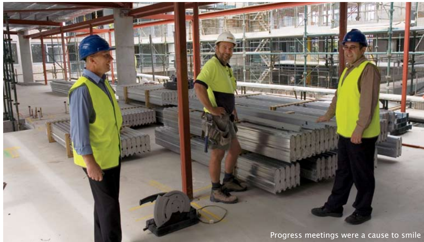
Progress meetings were a cause to smile