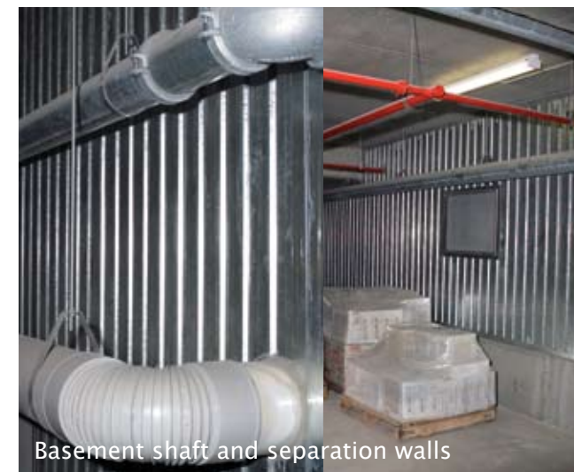
Basement shaft and separation walls