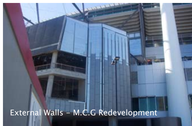
External Walls – M.C.G Redevelopment

The innovative and professional team at Speedpanel is constantly experimenting with the product to continue to provide lightweight, footprint saving high performance building systems.