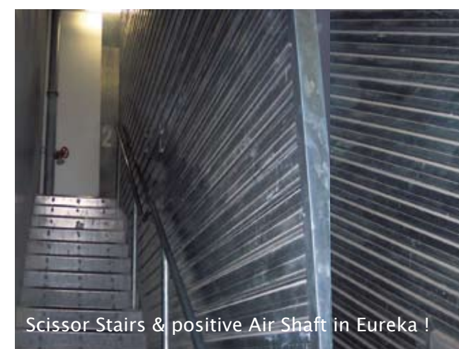
Scissor Stairs & positive Air Shaft in Eureka !

Speedpanel (VIC) Pty Ltd PO Box 469 89-91 Canterbury Road Kilsyth VIC 3137 p. 03 9724 6888 f. 03 9724 6889