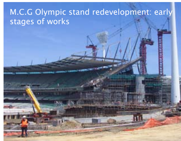
M.C.G Olympic stand redevelopment: early stages of works

Speedpanel systems reduce site labour, mess, and engineering requirements (including scaffolding required to install some 'traditional' alternatives) that were previously assumed to be an unavoidable nuisance of the construction process. Not only are Speedpanel systems extensively tested