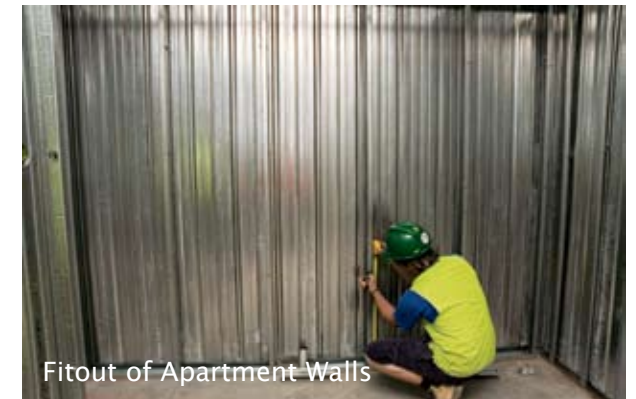
Fitout of Apartment Walls

sible for the design of an extremely soundproof wall, whilst maintaining a thin wall footprint. The final product aims to maximise living space, yet at the same time provide a high level of privacy, fire and sound protection.