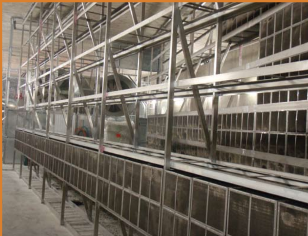
Filtration equipment installation