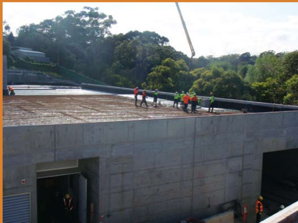
Roof concrete screed pour stage 1