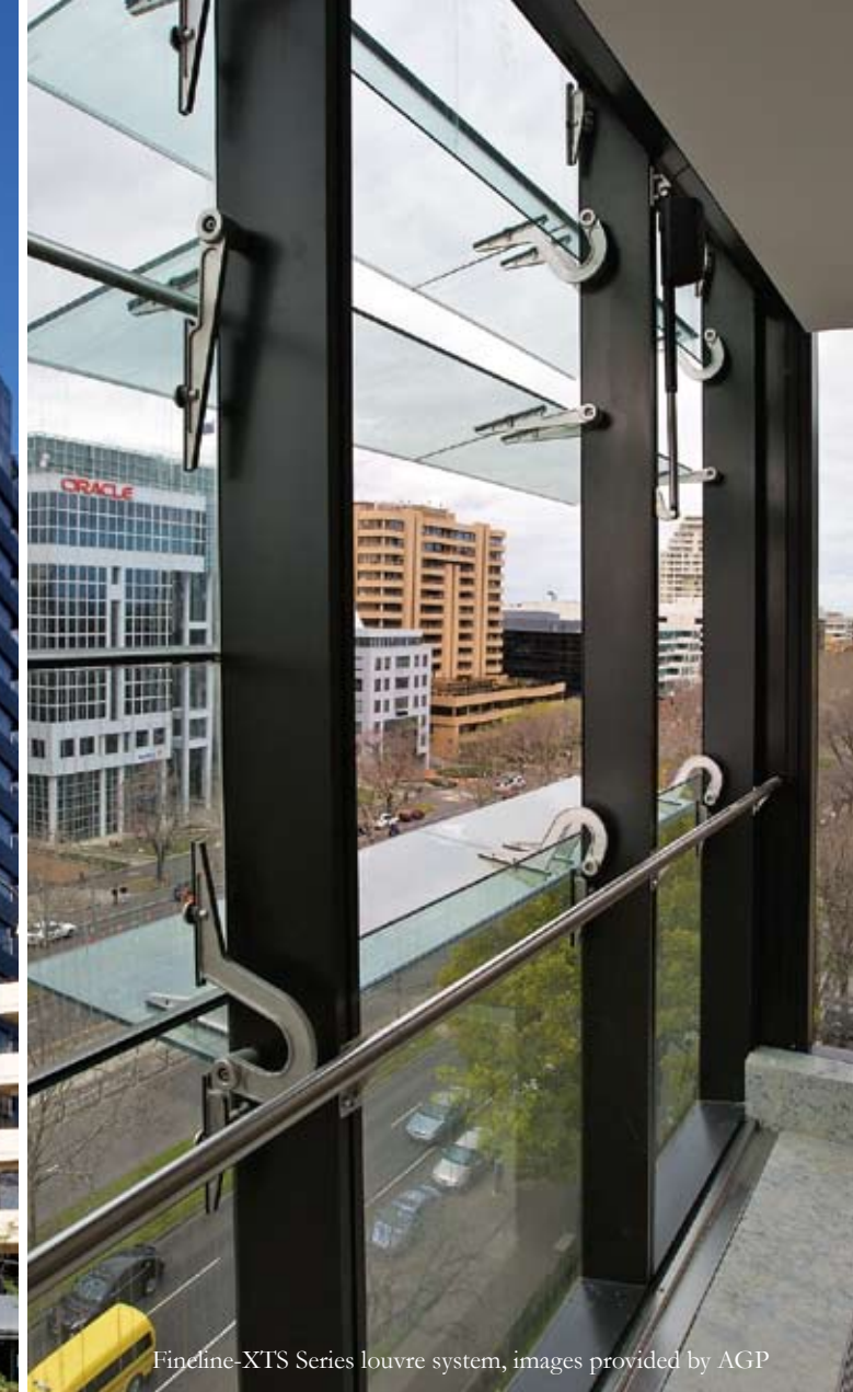
Fineline-XTS Series louvre system