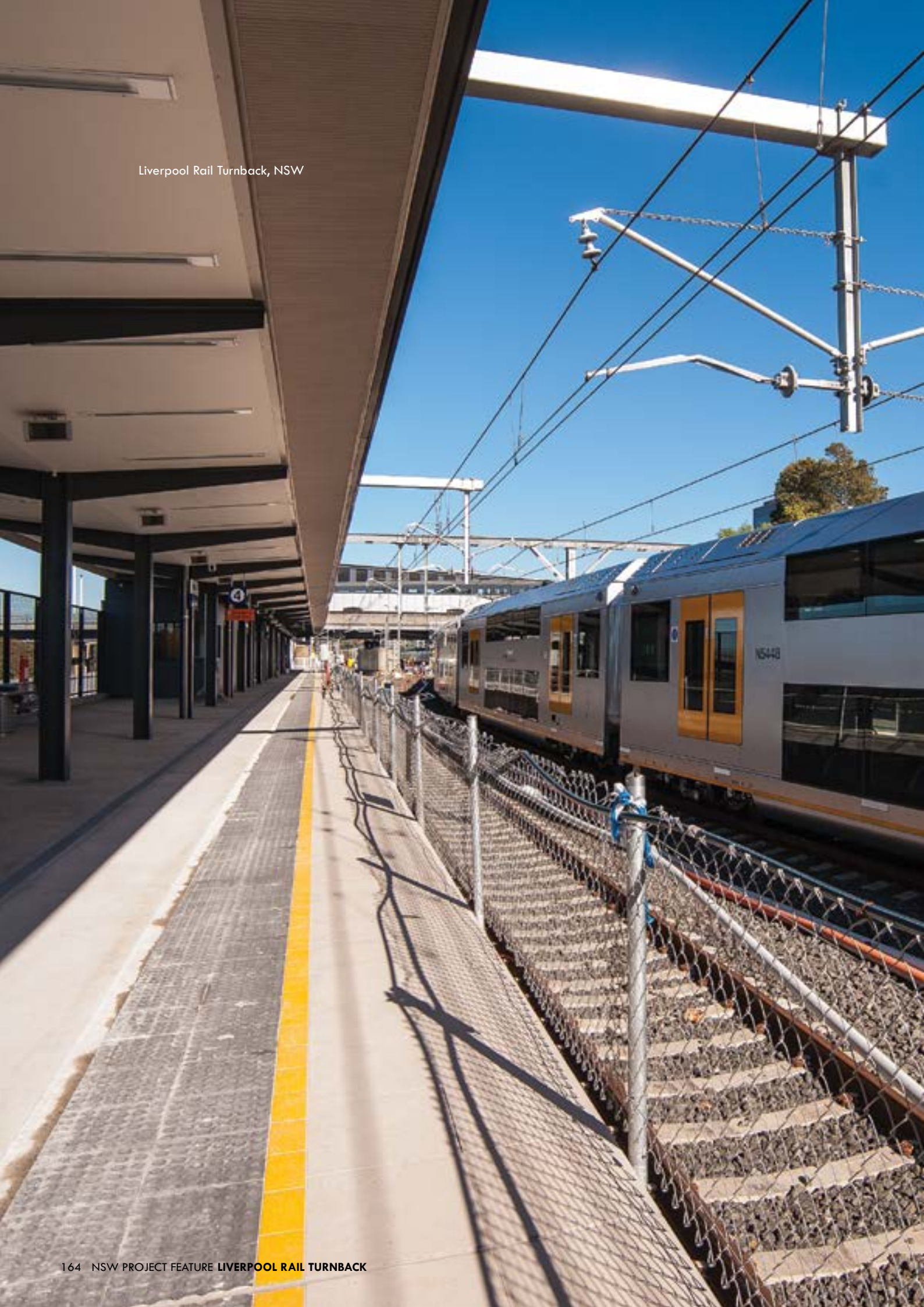
Liverpool Rail Turnback, NSW