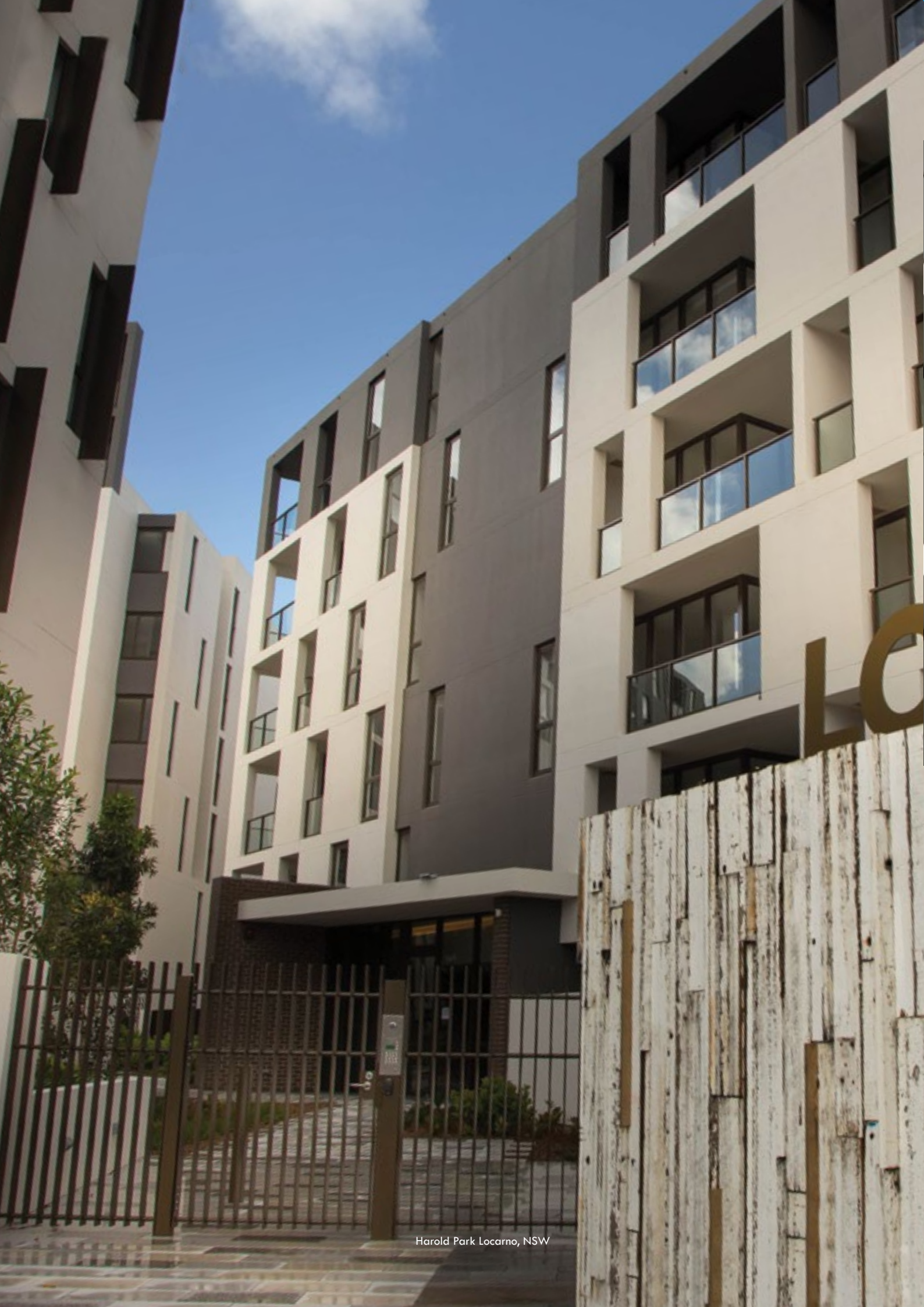
Harold Park Locarno, NSW

Below De Martin & Gasparini was contracted to supply, pump and place concrete on site.