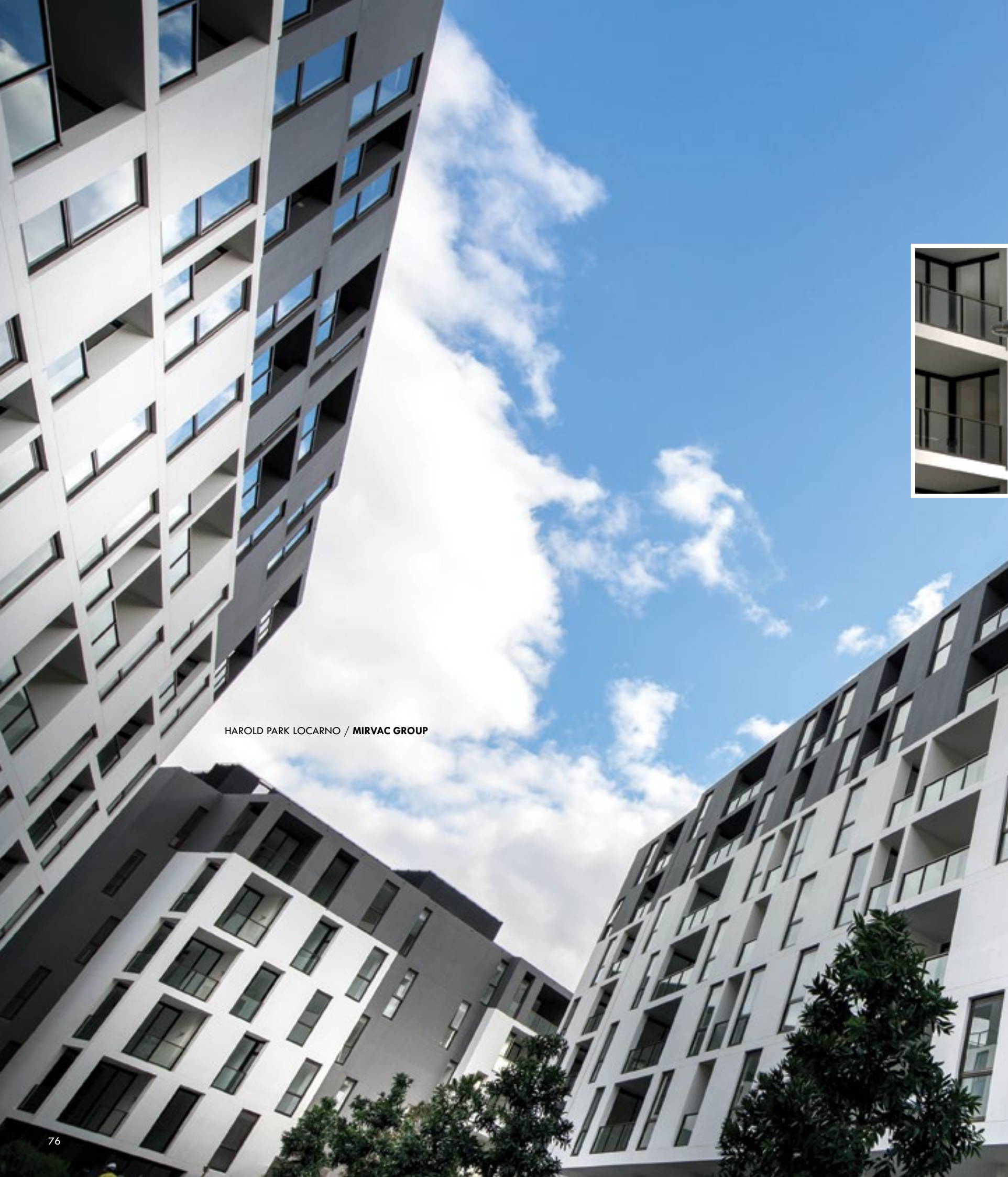
HAROLD PARK LOCARNO / MIRVAC GROUP

Left Locarno is one of 6 precincts within Harold Park