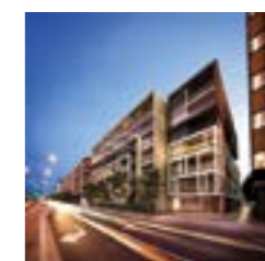
RAPTL Burnley Street Richmond