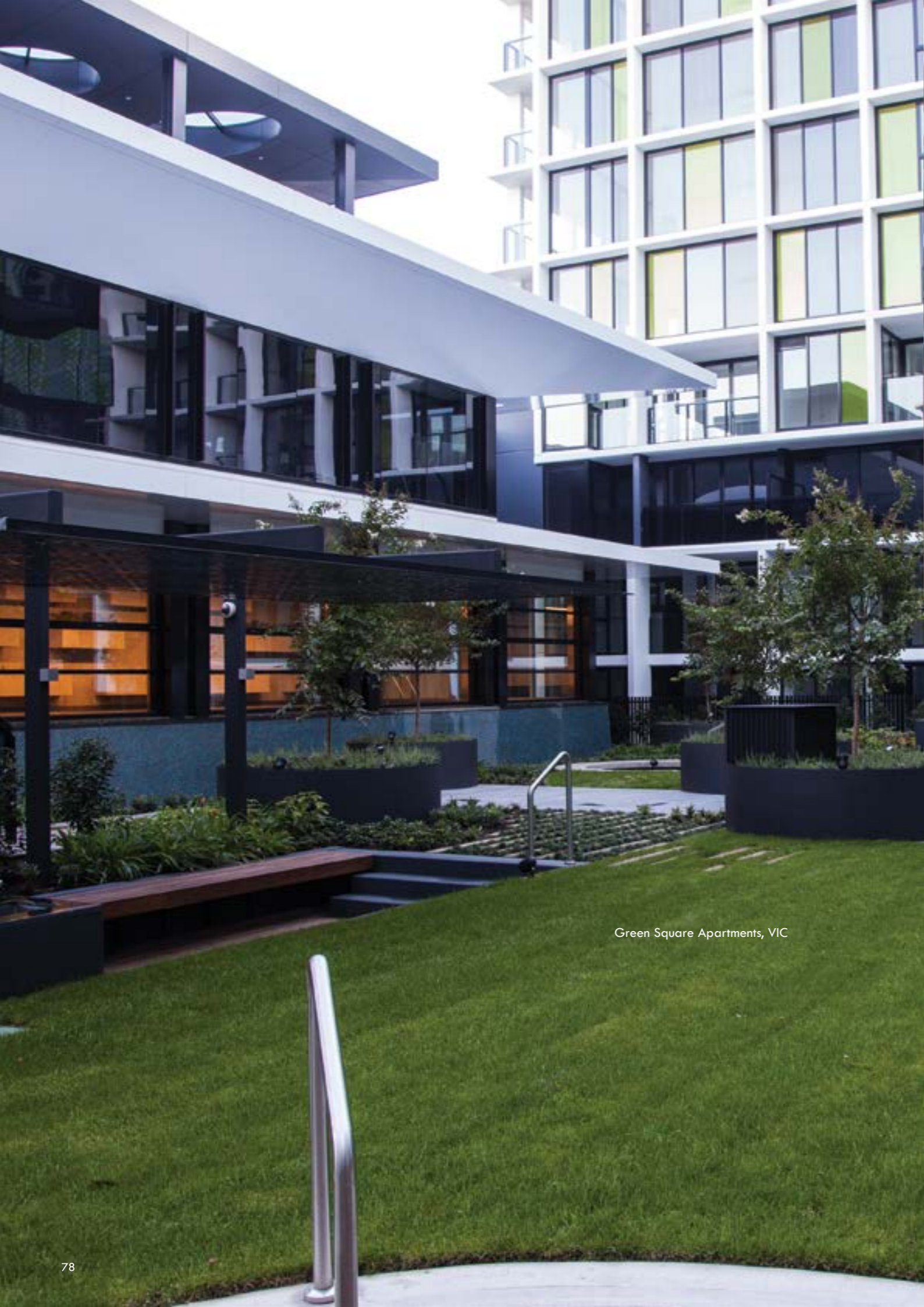
Green Square Apartments, VIC