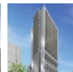
Art On The Park Melbourne