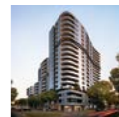
NORTH Flemington Rd North Melbourne