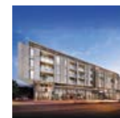
Emblem Apartments Hawthorn