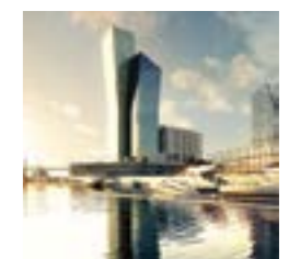
Pearl River Apartments Docklands