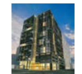
Guilfoyle Apartments South Melbourne

Lower Ground Floor 15 Queen Street Melbourne VIC 3000 t. 03 9614 7155 f. 03 9614 7166 e. paul@webberdesign.com