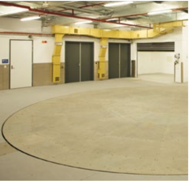
The turntable in Sydney East Data Centre is 10 metres in diameter.

For more information contact Spacepark Global Pty Ltd, 1/3 Gatwick Road, Bayswater VIC 3153, PO Box 182 Park Orchards VIC 3114, phone 1300 64 00 70, fax 1300 640 072, email info@spacepark.com, website www.spacepark.com