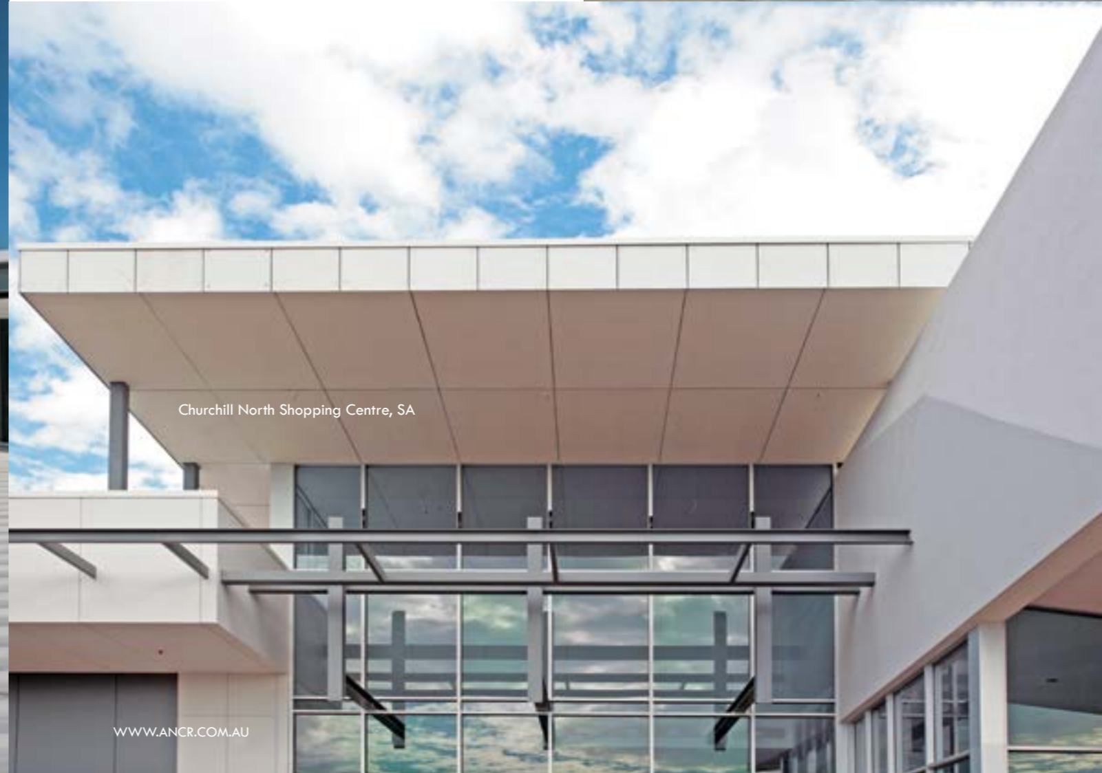
Churchill North Shopping Centre, SA